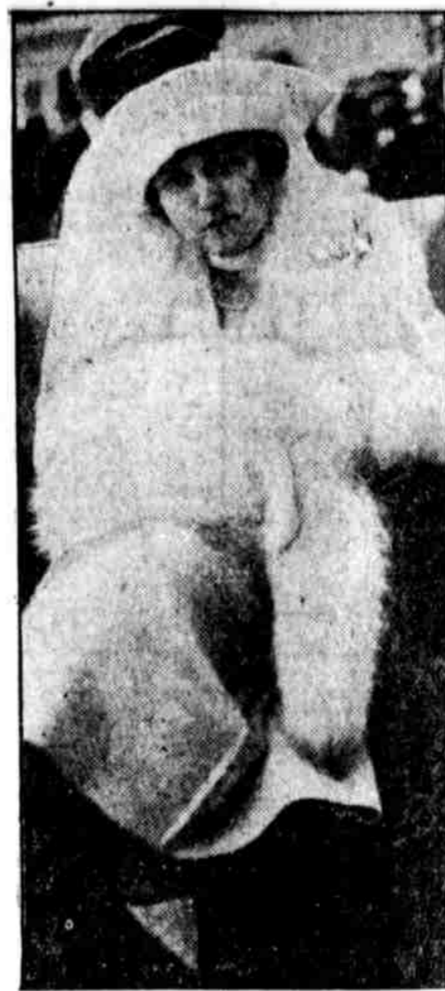
ALL IN WHITE. This young woman attracted much attention on the Boardwalk in her spring attire.