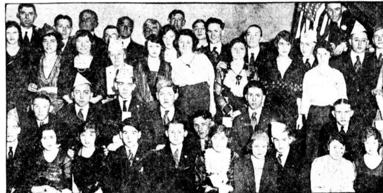
DREXEL-BIDDLE BIBLE CLASS ACTS AS LIM'RICK JURY. The class, which is known as No. 5, meets at the Presbyterian Church of the Evangel, Eighteenth and Tasker streets. They gave a dinner last week and the whole crowd voted on the lim'rick, the prize for which is awarded today. The photograph shows a section of the crowd.