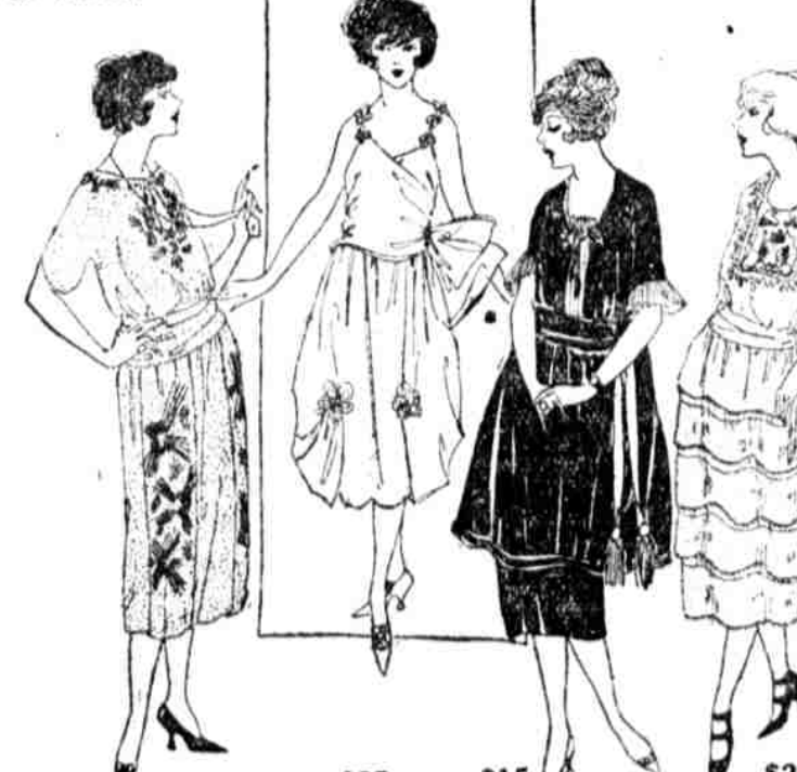
$39 $25 $15 $23.50

Never such charming fashions, never so many of them!