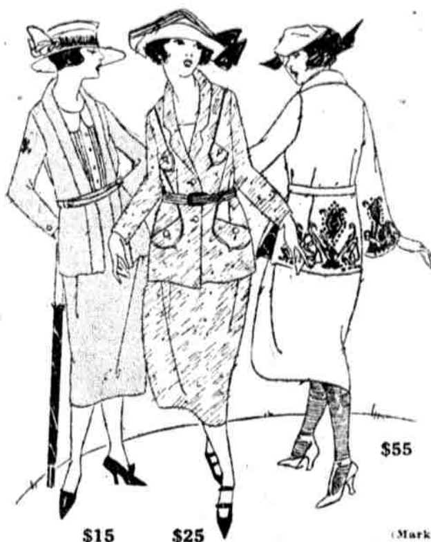
$15 $25 $55