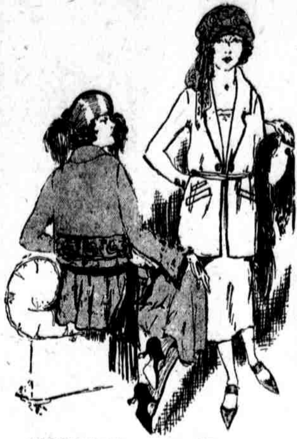
Color-Embroidered Tricotines, $39.75 A Particularly Smart Tweed, $33.75