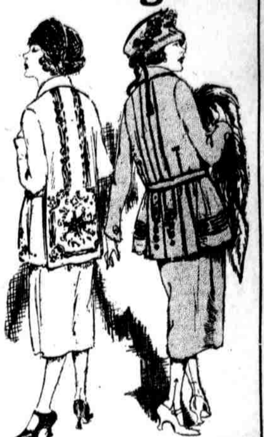
Embroidered in Iridescent Beads, $39.75 Braid-Trimmed Serges, at $33.75

Mostly tricotines and mostly navy blue. Some exceedingly fine serges. Some black suits in both the tricotines and the serges. Styles and styles and styles! Plenty of the "staple styles"—the kind to wear anytime and anywhere—and the kind of styles that last. Some may have a touch of cording—or braid. But each is touched with smartness! Embroidered dressy styles, too. And beaded models—brides especially like them. And some adorable tweeds.