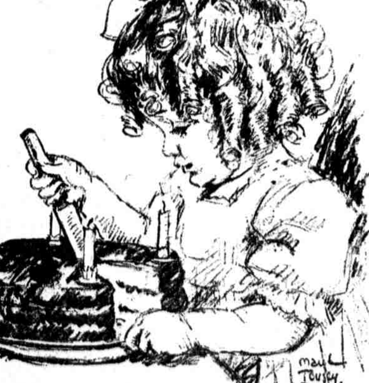
H. O. WILBUR & SONS, INC., Philadelphia, Pa., Makers of Wilburbuds

Recipe book on how to use Wilbur's Cocoa and Baking Chocolate sent free on request.