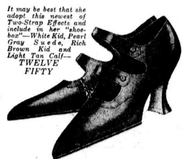
It may be best that she adopt this newest of Two-Strap Effects and include in her "shoe-box"—White Kid, Pearl Gray Suede, Rich Brown Kid and Light Tan Calf—TWELVE FIFTY