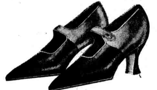
Demure simplicity may lead her to choose this perfectly modeled Pump. NINE FIFTY