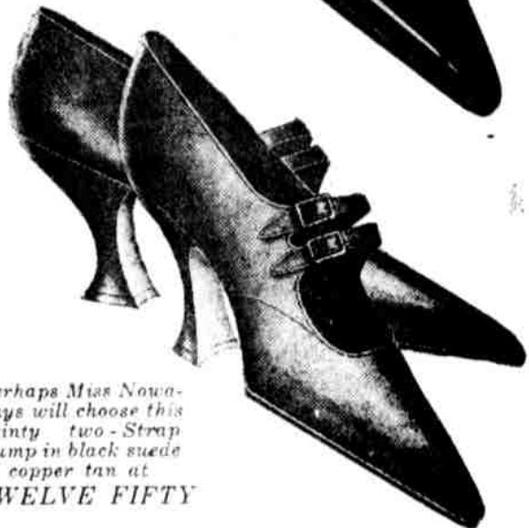
Perhaps Miss Nowadays will choose this dainty two-Strap Pump in black suede or copper tan at TWELVE FIFTY