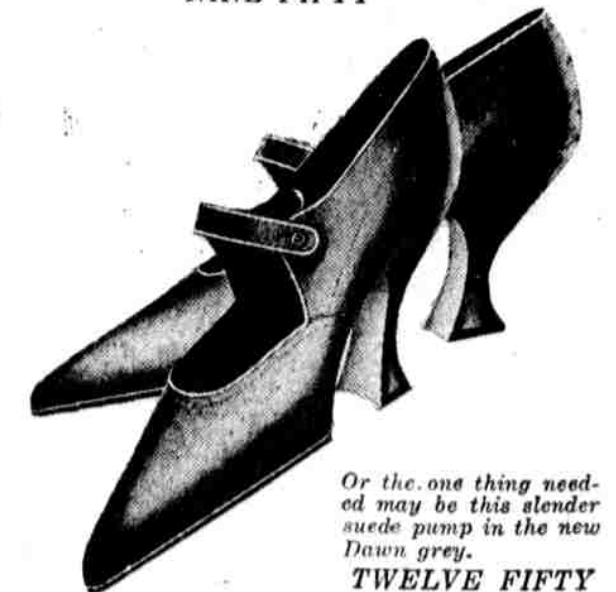
Or the one thing needed may be this slender suede pump in the new Dawn grey. TWELVE FIFTY