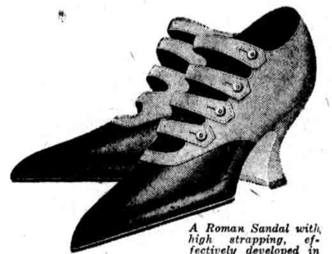
A Roman Sandal with high strapping, effectively developed in grey and tan, may be ideal. NINE FIFTY