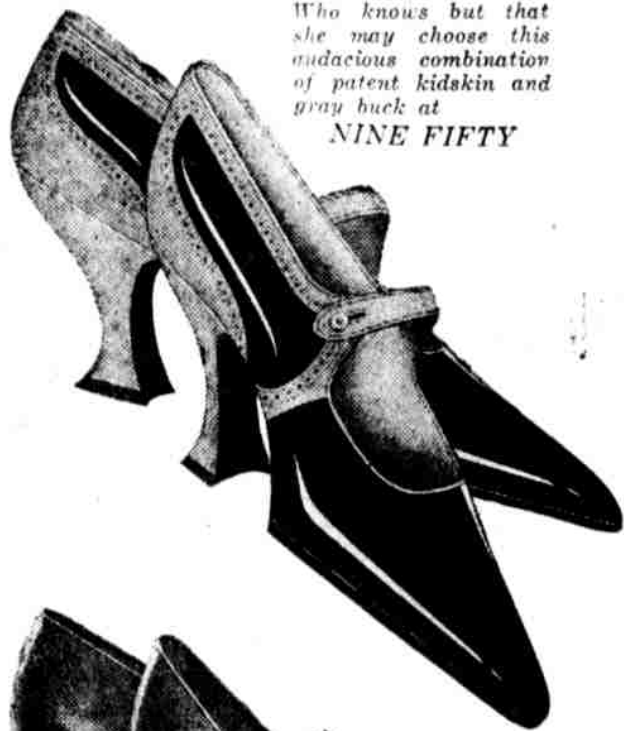
Who knows but that she may choose this audacious combination of patent kidskin and gray buck at NINE FIFTY

If you desire the convenience of a charge account at the Hallahan Stores, all that is necessary is to send us three business references—we will do the rest, and thank you.