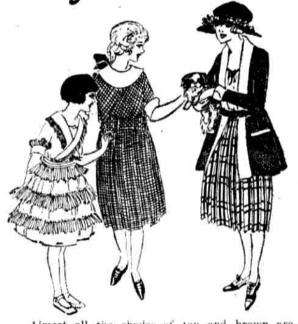
Almost all the shades of tan and brown are represented, and there are many blues and greens. Sports coats, cape effects and dolman wraps are all here for girls who wear sizes 12 to 16 years.

Styles are quite varied in coats of polo cloth, plain or checked velour and homespun weaves. Colors, too, allow choosing.