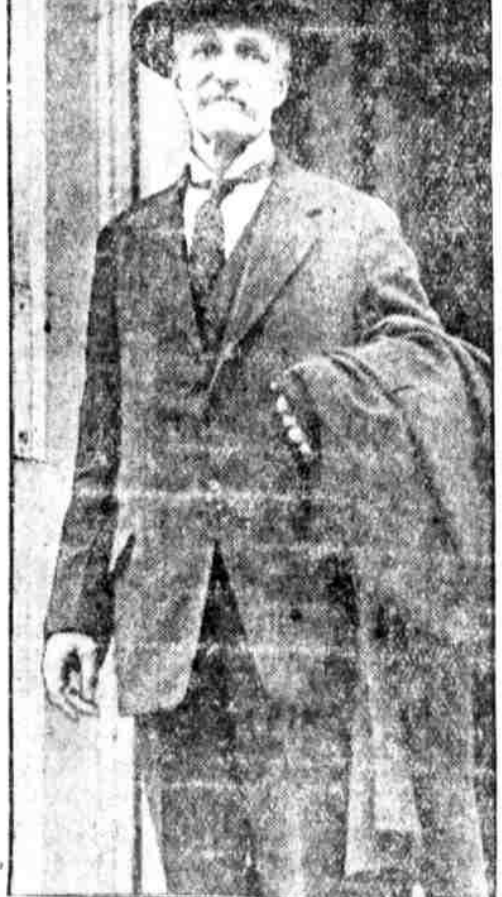
CALLS ON PRESIDENT HARDING. Gifford Pinchot was snapped as he left the White House.