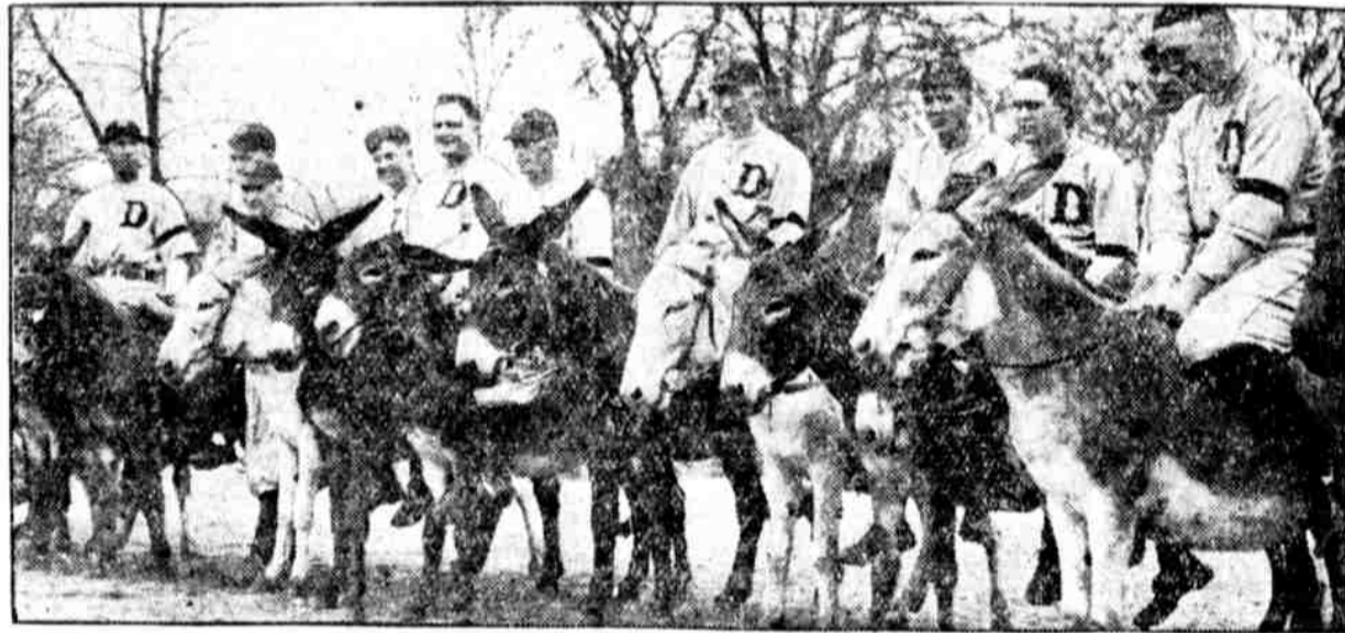
TIGERS ON DONKEYS. These Detroit baseball players are having a wonderful time at San Antonio, Tex. Ty Cobb, the new manager, gave his approval to the hour of race track work. Heilmann, at the right, rode the winner.