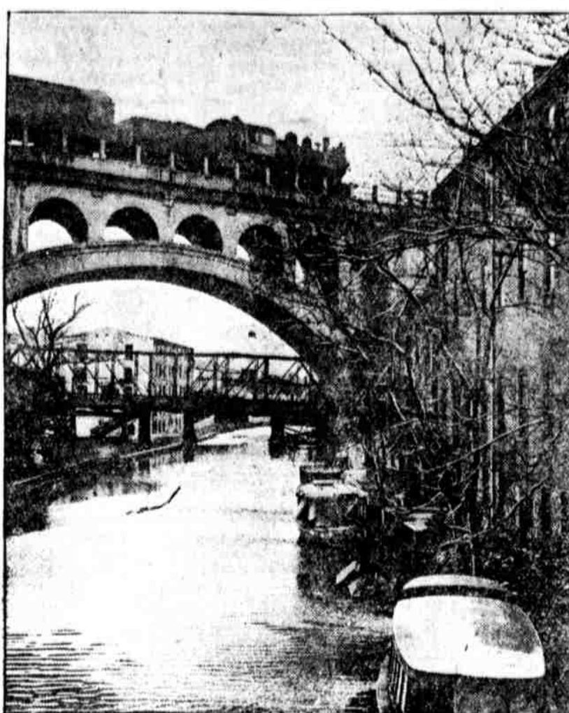
A GLIMPSE OF MANAYUNK. Portion of the Manayunk Canal that is lined on either side with mills was snapped by our photographer yesterday. A Pennsylvania Railroad passenger train on the Schuylkill division was caught on the bridge.