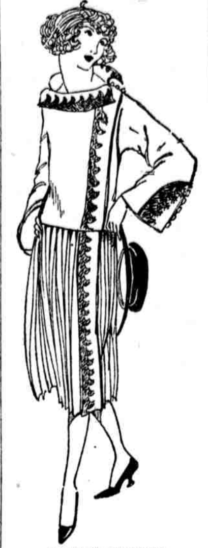
By CORINNE LOWE

It does not have to be the road to Mandalay. If we wish to see the coolie jacket all we have to do is to take the road to Florida. The fact of it is that never were there so many loose-fitting jackets worn in America.