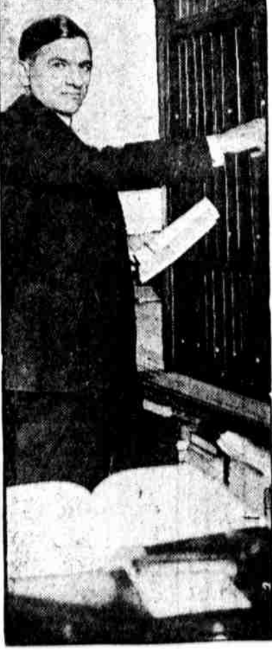
CLARENCE CANNON, Parliamentarian of Congress. He's a Democrat, but was selected for his station by a Republican speaker.