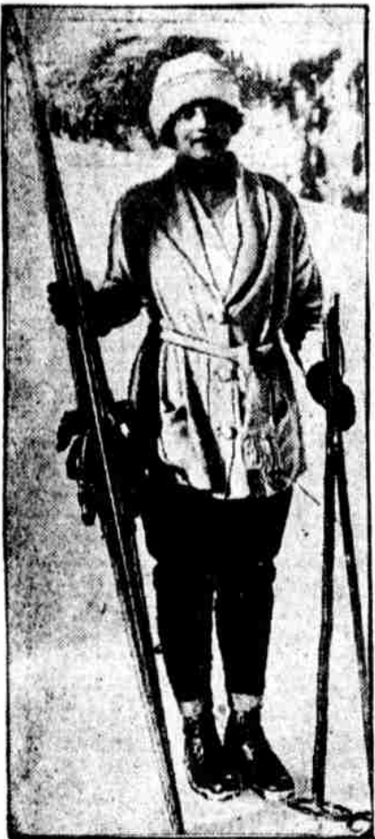
A SWITZERLAND SPORT GIRL. While Philadelphia is enjoying springlike weather, the folks across the waters are following winter sports.