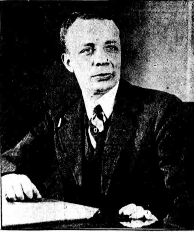
AT HIS DESK. Colonel Theodore Roosevelt, of New York, as assistant secretary of the navy.