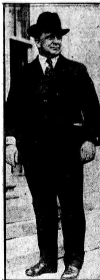
SECRETARY OF LABOR JAMES J. DAVIS was photographed at the White House a few days ago. He's a Pennsylvanian.