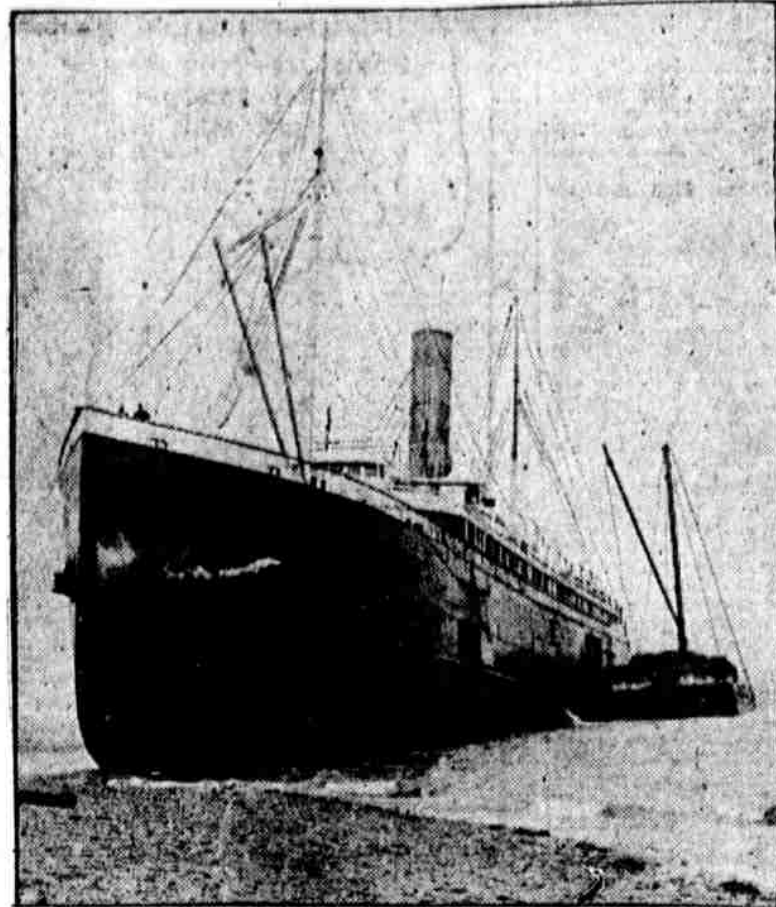
HIGH ON THE GRAVEL BEACH. The S. S. City of Columbus ran ashore on Lovell's Island, near the entrance of the Boston harbor, Tuesday morning. Five tugs failed to free her. The cargo is being taken off.