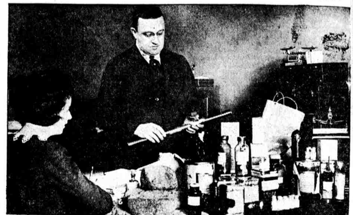
A SATURDAY DRUG RAID. United States Commissioner Long is making a close examination of the loot taken by the federal authorities. His secretary is listing the drugs and equipment.