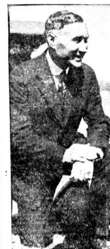
NOT A STRANGER TO YOU. Hugh Jennings, former manager of Detroit. He is now helping to whip the New York Giants into shape at San Antonio.