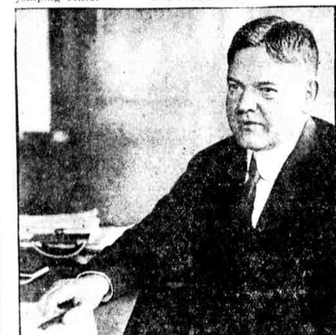
THE SECRETARY OF COMMERCE, Herbert C. Hoover, photographed for the first time at his desk. He insisted on simple ceremonies surrounding his induction into office.