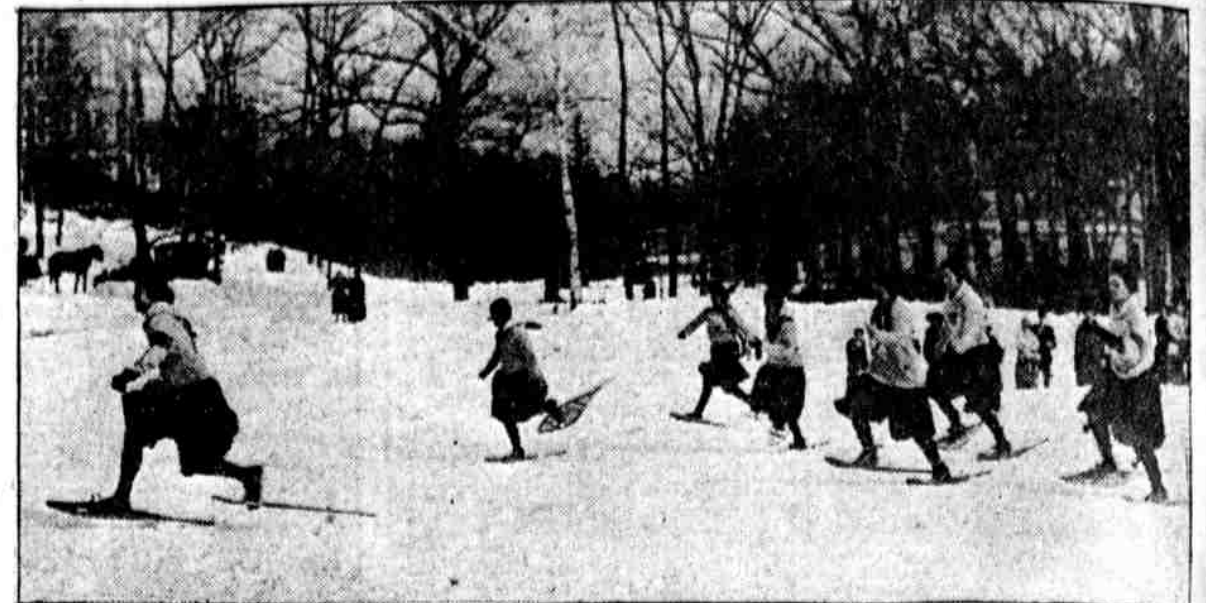
LONG-DISTANCE SNOWSHOE RACE. Girls at Wellesley College did very excellent work in their annual winter sports carnival. Lots of snow adds much to the program.