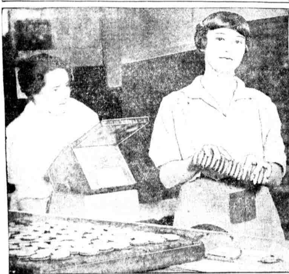
PACKING CAKES. The women workers are taking the large trays from the moving belts and packing the cakes into tins at the bakery of J. S. Ivins' Sons, 627 North Broad street.