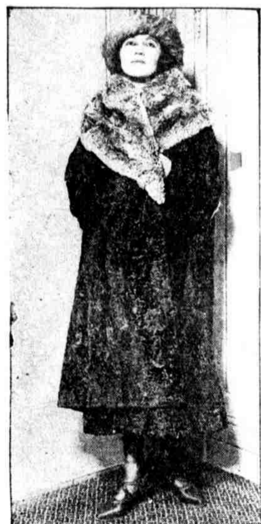
MRS. HARDING'S INAUGURAL DAY COAT. An exclusive photograph of a coat of broadtail with a chinchilla collar. It is lined with platinum gray.