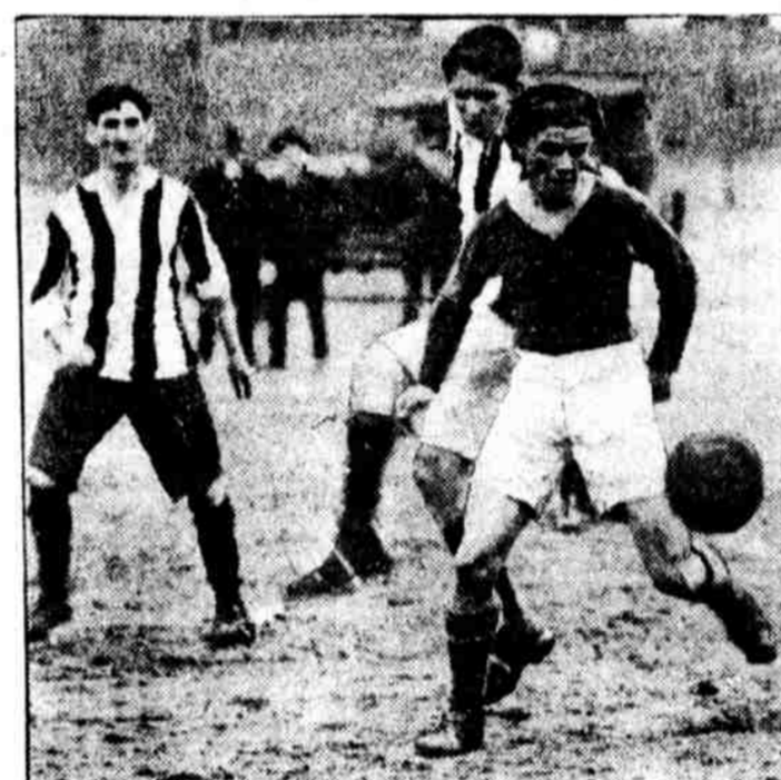
LIVELY SOCCER. A team from the steamship Galtymore, of Glasgow, matched with a picked team at B and Ontario streets. The sailors were defeated.