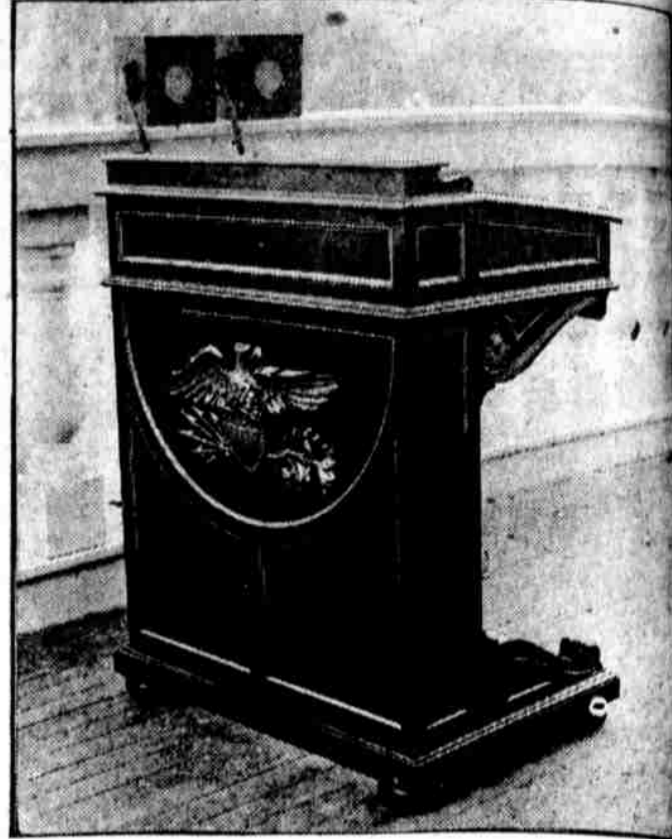
THE INAUGURAL DESK. It was used by Warren G. Harding in Washington this afternoon, when he took his oath of office and delivered his inaugural address.