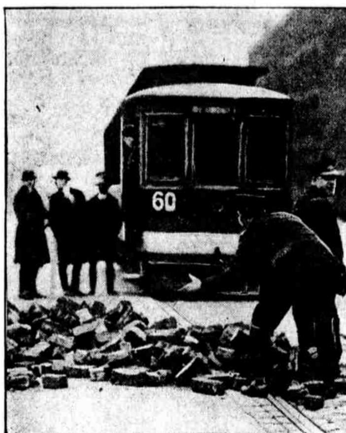
STREET CAR STALLED. These bricks were found on the track at B street and Allegheny avenue. The empty wagon was found two squares away. The driver was dead.