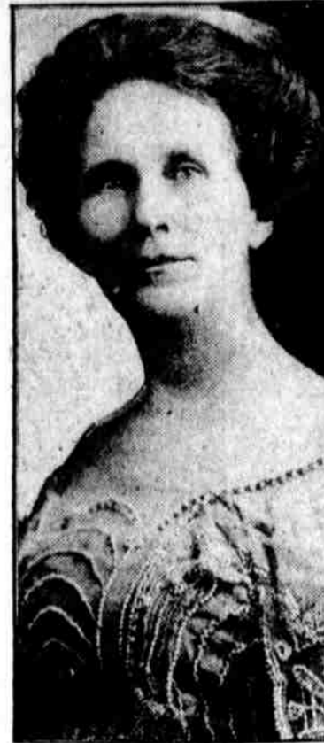
MRS. ALBERT B. FALL. She is the wife of the new secretary of the interior. They live in New Mexico.