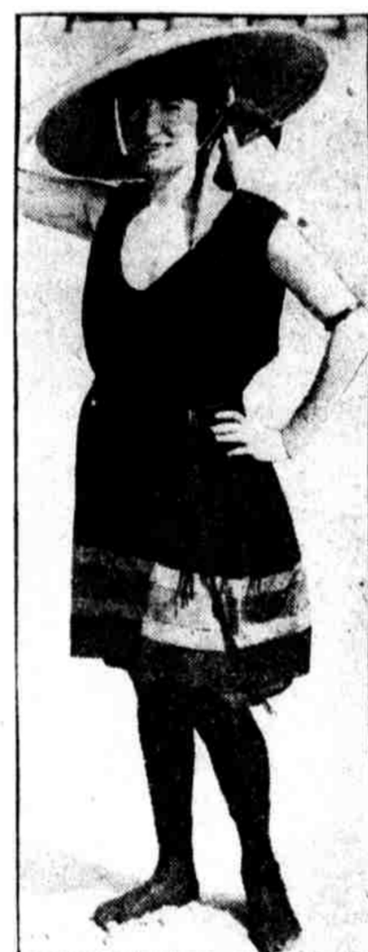
UNDER A JAPANESE BONNET. Mrs. Claude Graham White, the former Ethel Levey, at Palm Beach.