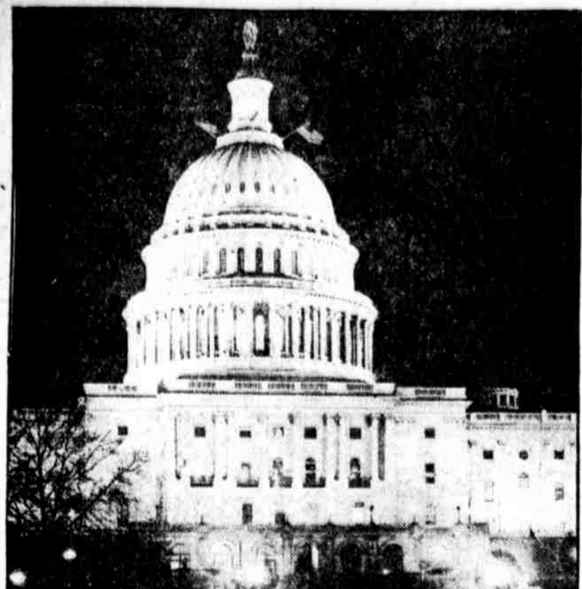
THE CAPITOL. Dozens of high-powered search lights, together with other illumination, were played on the Capitol last night. Republican clubs found the well-lighted section of the city a good place to show off their parade clothes.