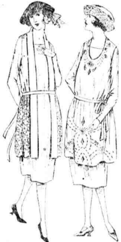
On Sale Only Misses' Dept.—11th Floor

About 125 Misses' Dresses Of Jersey Cloth