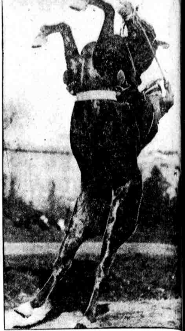
STANDING ON ONE LEG. A New York police department horse is being trained in Central Park by one of the experts of the mounted squad. The rider is hanging on.