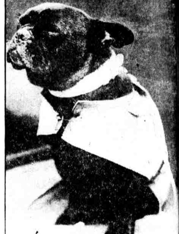
BORED TO DEATH. This French bull pup is showing his contempt for the people who dressed him up with a new collar and a new coat at a London dog show.