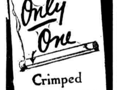
The Only One Crimped

Of the thirty-five bodies taken to the Chesterton morgue, a mile from the wreck, identifications had been made of all except two, but some of these were regarded by Coroner Seipel as unidentified. The coroner declared the death toll would not exceed thirty-eight. Eight of the bodies have been claimed by relatives and removed for burial. Bodies of four women and one man remained today unidentified, but some of them could only be recognized by relatives, officials said.