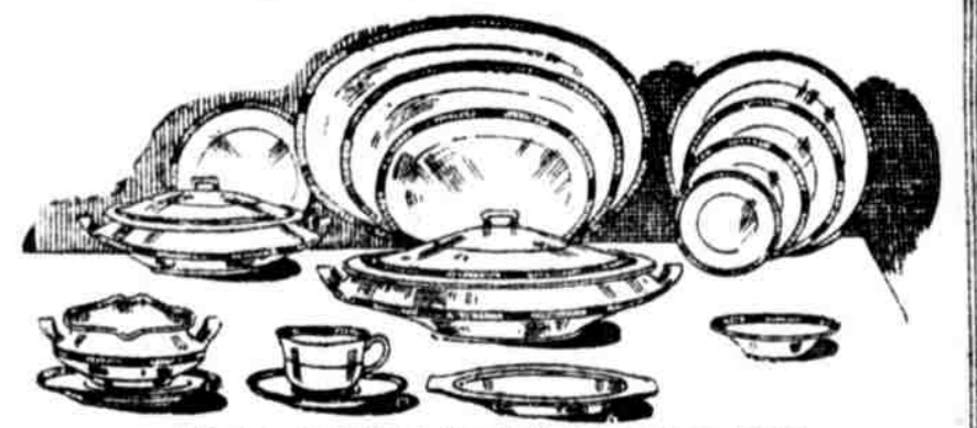
106-piece Coin-Gold Handled Dinner Sets, $37.50. Tan, black and gold—note the domino-shape decoration of black and gold within the gold bands. Pattern number 20,499.

Heavy-Cut Crystal—Seconds from America's finest maker—all wanted items, at a third regular prices. "Heisey" Glassware, a third to half less than regular. Scores of items for every household need. —Gimbels, Fourth floor