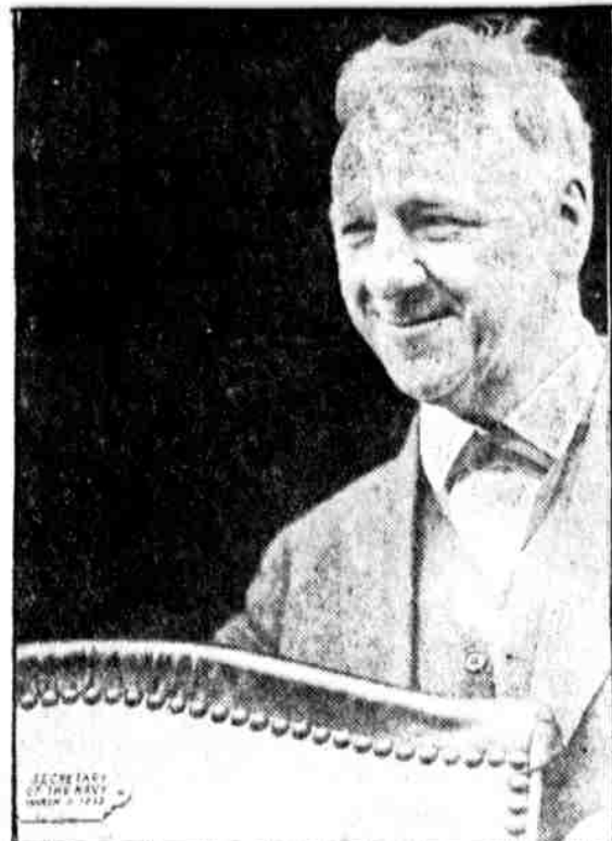
DANIELS KEEPS HIS CHAIR. The secretary of the navy didn't want to go home without the chair he has used in meetings of the cabinet. Members of Congress from North Carolina bought the chair and presented it to the retiring navy head.