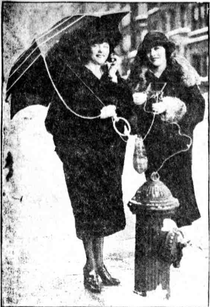
HERE WE HAVE THE WIRELESS PARASOL. Yes, the parasol has wires. They are used with the receiving wireless set. All you have to do is tie up to a fire hydrant or some other material that will act as a ground. Then start your set working.