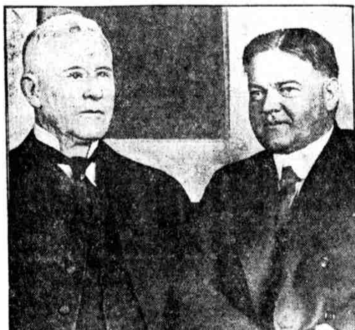
HOOVER VISITS ALEXANDER. Herbert W. Hoover (right), appointed by President-elect Harding as secretary of commerce, called on Joshua W. Alexander, the present secretary, a few days ago.