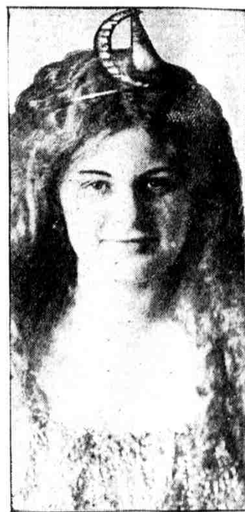
CONSTANCE CARPENTER will appear in "Cinderella," to be given tonight at the Metropolitan Opera House.