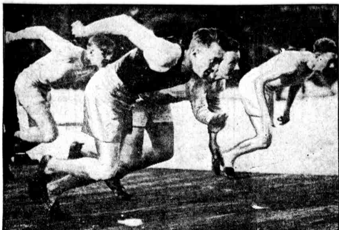
SPEEDING UP ON FRANKLIN FIELD. Start of the sixty-yard dash, one of the events of the weekly track meet in which Penn students are taking part.