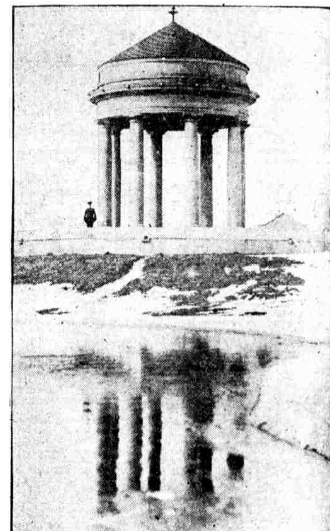
WINTER SCENE AT LEAGUE ISLAND PARK. The pavilion, built along the lake, is intended for band concerts.