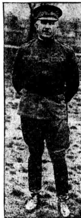
MAJOR GENERAL LEONARD WOOD. Rumors persist that he may be the next provost of the University of Pennsylvania