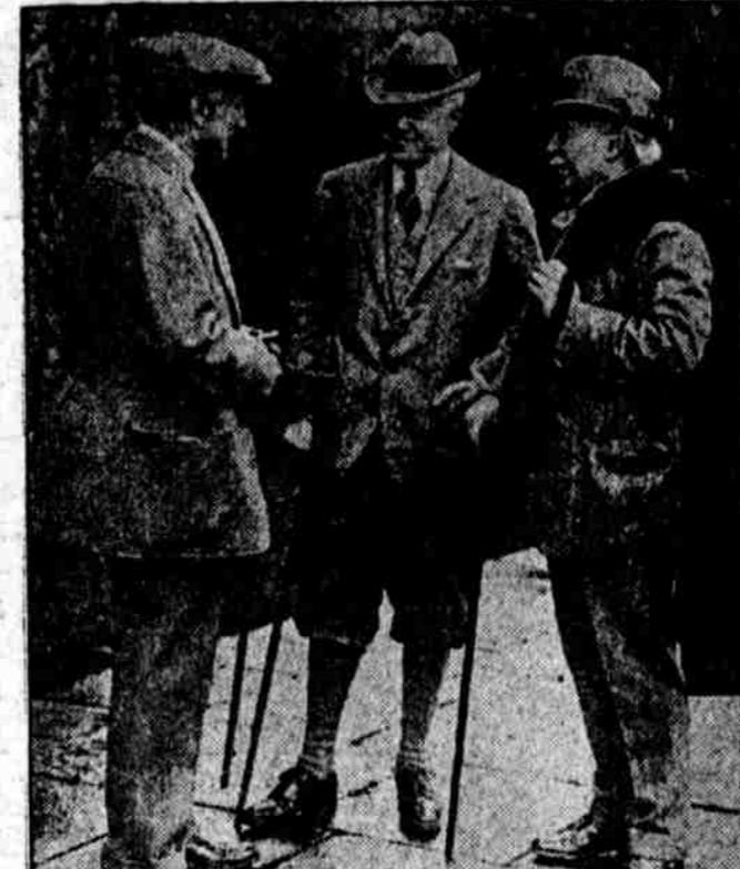
A HAPPY TRIO. Lord Reading, new Viceroy of India; Ambassador Davis of the United States and Lloyd George enjoy a confab at the country home of the British premier