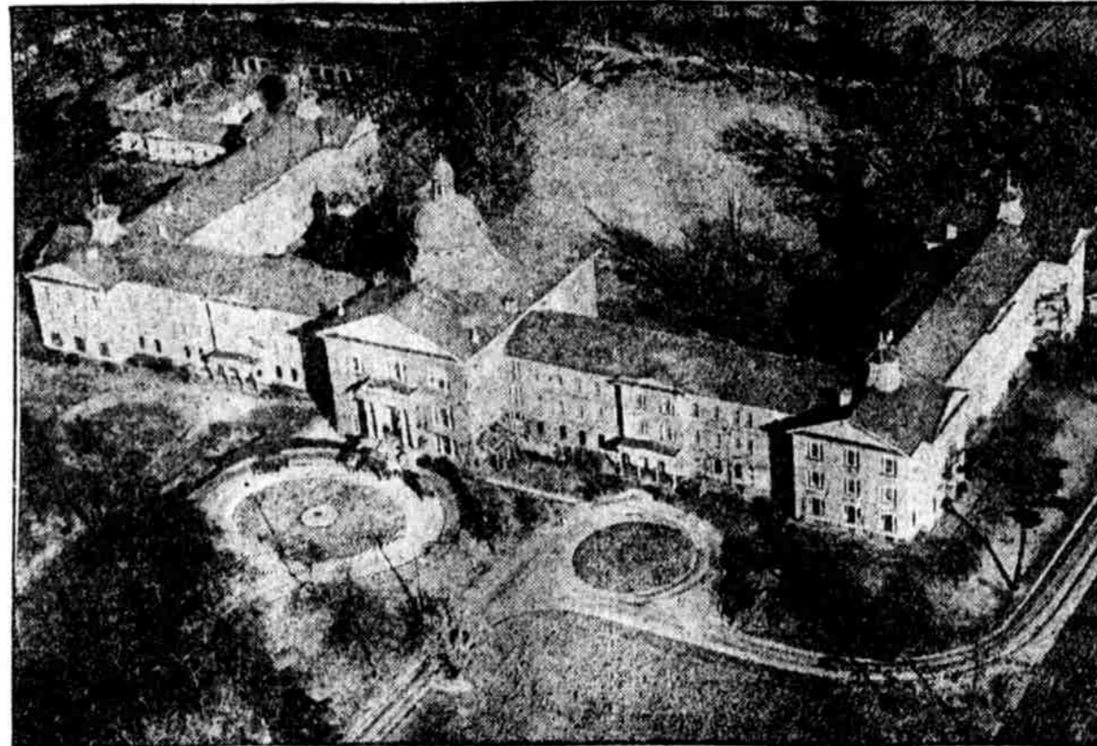
THE PENNSYLVANIA HOSPITAL. The women's building of the department for mental and nervous diseases, located at Forty-fourth and Market streets, was photographed from the Ledger newsplane. The men's department building at Forty-sixth and Market streets is of similar architecture