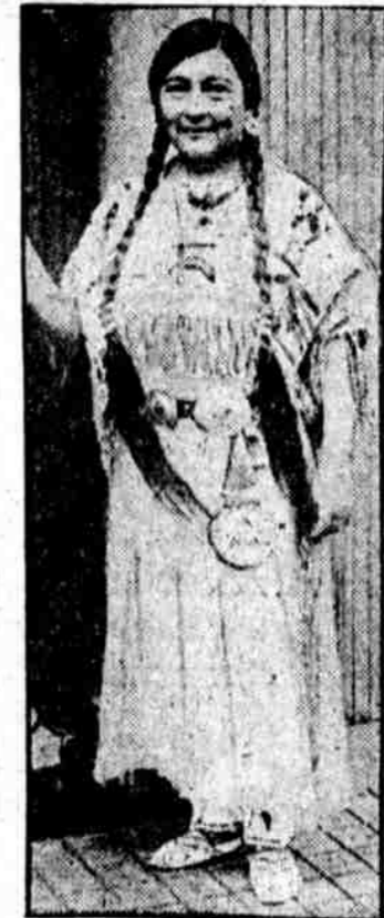
SHE IS WATCHING CONGRESS. Mrs. Gertrude Bonnin, a Sioux princess, keeps close watch on Indian legislation in Washington