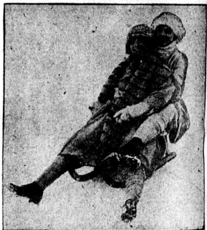
OUT FOR A RUN IN SWITZERLAND. Two of England's fairest, dressed in the latest of winter fashion, enjoy a sled ride at Murren