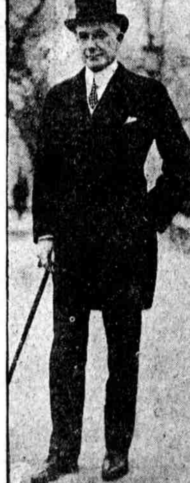
HENRY P. FLETCHER. He will be the under-secretary of state in the cabinet of President-elect Harding