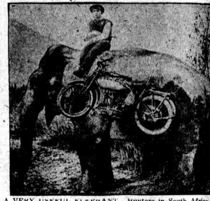
A VERY USEFUL ELEPHANT. Hunters in South Africa adopt this method of getting the motorcycles over the veldt land, where the vehicles cannot be operated