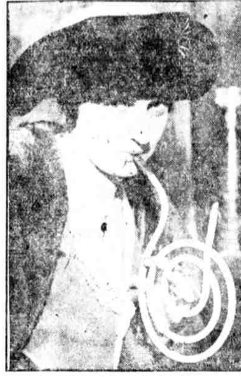
A LONG, COOL SMOKE. English girls are using the "tobacco tube," the latest in smokers' wear. This, of course, keeps the fingers from becoming stained. It's no vest-pocket arrangement.