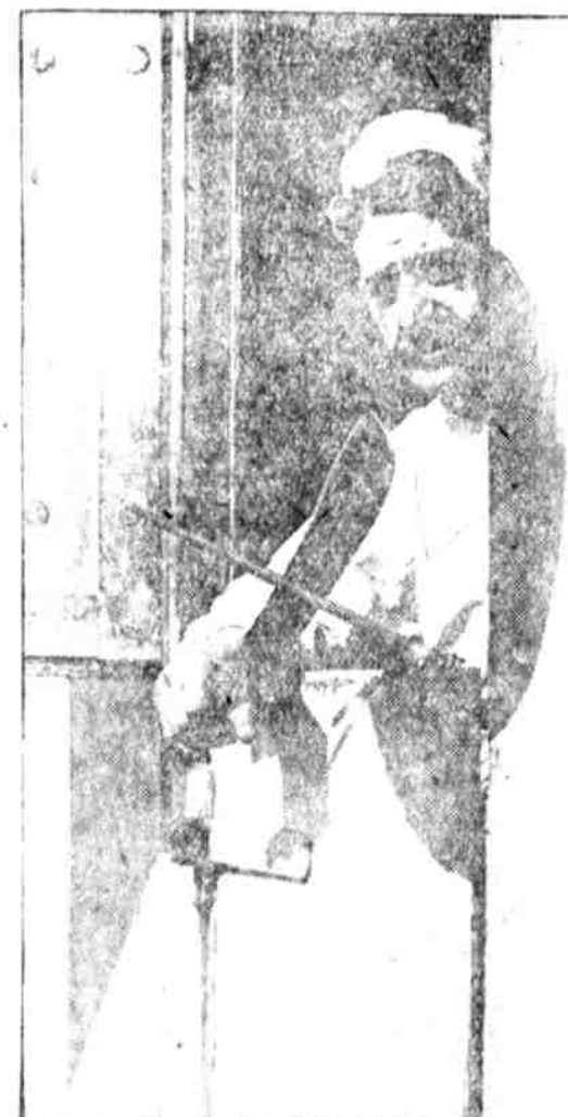
JUST A LITTLE SUNSHINE. The cook of the steamship ... tied up at Pier 28, South Wharve, as he harpens his butcher knife.