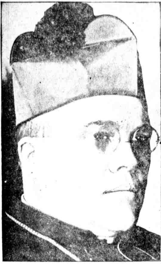
ARCHBISHOP DENNIS J. DOUGHERTY. The archbishop took time during the busy hours of yesterday for an exclusive pose for an EVENING PUBLIC LEDGER photographer. This morning he started his journey to Rome, where he will be created cardinal.