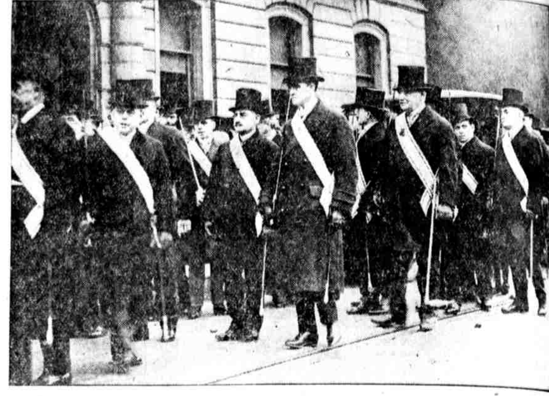
PART OF THE GUARD OF HONOR. These men, members of the Fourth Degree of the Knights of Columbus, formed a cordon about the archbishop's automobile during the procession.