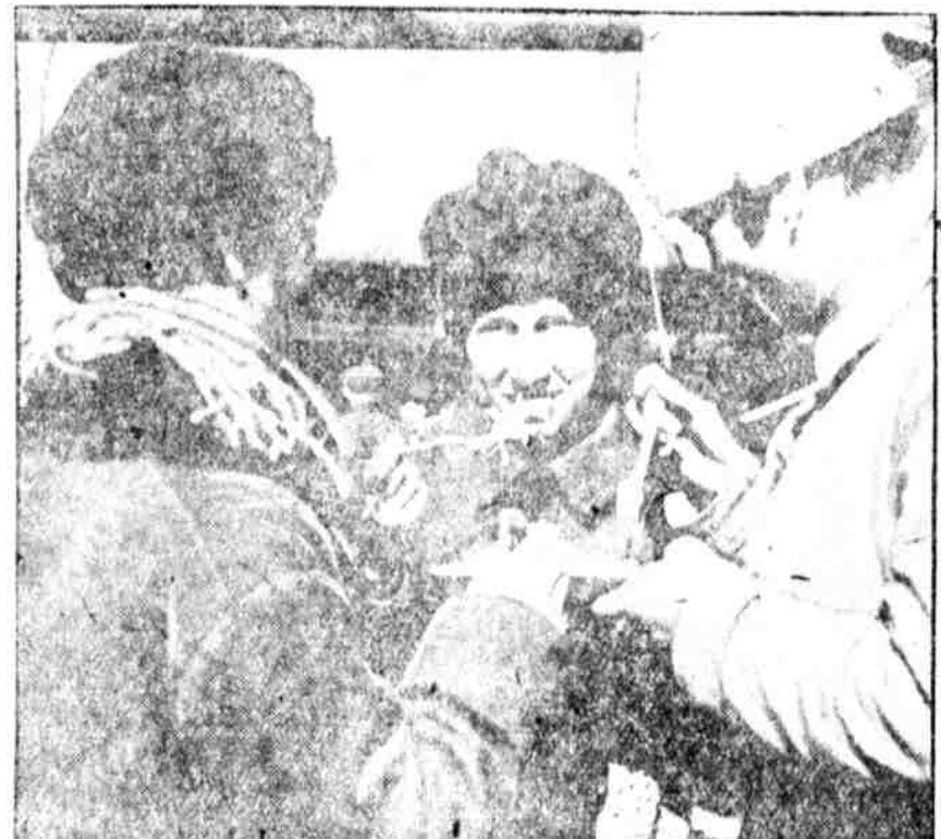
THEY ARRIVED FROM ITALY YESTERDAY. As these women foils waited the return to meet the immigration officials, on the arrival of the Ferdinando Palasciano, an Italian-American liner, they enjoyed a good meal of spaghetti.