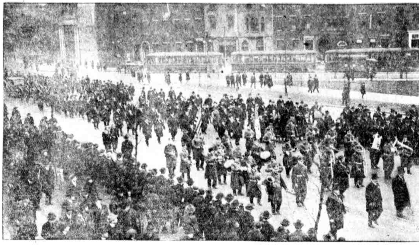
ON THE WAY TO BROAD STREET STATION. The procession in honor of Archbishop Dougherty was viewed by hundreds as it passed down the Parkway, at Sixteenth and Arch streets, before 8 o'clock this morning. The band preceded the automobile in which church dignitary rode.