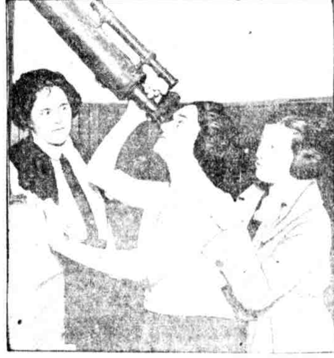
OBSERVATORY PARTY. A group of Washington observatory party members were seen at the observatory on the night of the party.