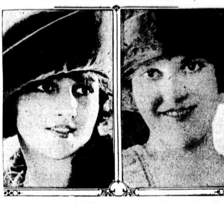
That is what we should all like to have people say about us and our chil-Here are some suggestions that will help us to bring it about

Coarse and hard foods, requiring effective war upon it so that the total erunching, like toast, hard breads, hard fruits, fibrous vegetables and nuts require chewing and should be included have experienced no suffering from have experienced no suffering from in a child's diet (and in the grown-ups', toothache and who are religious enough too, for the same reason.)