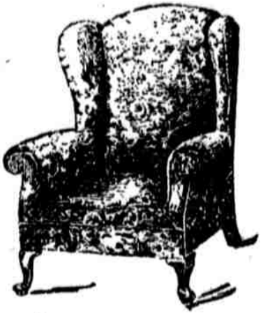
$85.00 Tapestry Covered Easy Wing-Back Chair, $54.00. Windsor Chair, $10.50 up. Over-stuffed Royal Easy Chair, $29.50 up. Morris Chairs begin at $10.75. Reed Fiber Rockers, at $3.50, and Golden Oak Rockers, start at $3.75. Chairs for every purpose in all the Modern and Period Designs. See these and save.

An inspiration and an opportunity. A Sale as marvelous in magnitude and as wonderful in variety as it is incomparable in values. Virtually the wealth of America's foremost factories are spread before you in acres of Furniture. With the best from the hands of our own Master Craftsmen to keep it company. Many handsome designs that you can expect to find nowhere else in America.