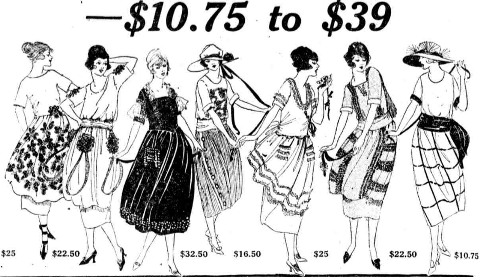
"Nice but too plain. I like fancy frocks"—so the young girl, speaking of her little old winter dress.

They need to be cut and hemmed, but the white mercerized damask is in a good design and is excellent quality.