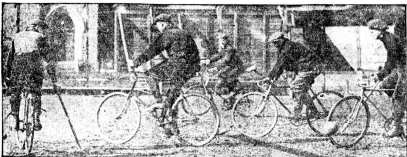
BICYCLE POLO. Members of the Quaker City team practicing at Broad street and Allegheny avenue. The new sport is attracting a lot of lads who are lucky enough to have a "bike."