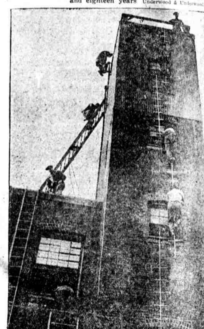
LEARNING TO BE FIREMEN. These men are being taught how to do ladder work properly on the tower of the fire department's school, on Seventh street.