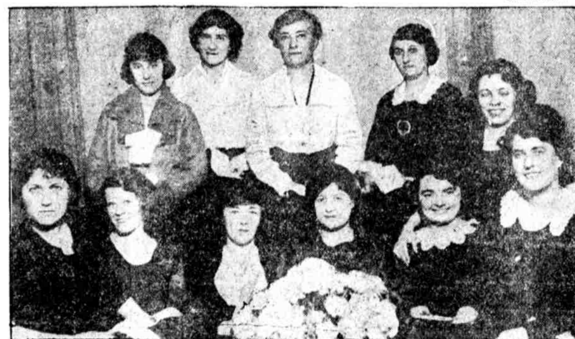
FAIR JURY FROM THE SUPPLEE-BIDDLE HARDWARE CO. JUDGES LIMPIN' LIMERICKS. Flowers in everything helped to select the winner of the $100 prize in the limrick contest announced on Page 2. The jury was composed of employees of the Supplee-Biddle Hardware Co., 513 Commerce street.