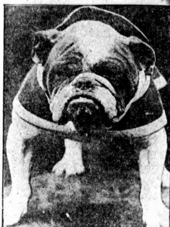
A "WHITE HOPE." This champion bulldog claims Indianapolis as his home, according to his collar inscription. He'd make a wonderful bandit chaser.