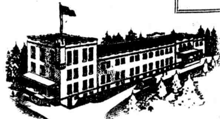
The Rex Seal plant, in the heart of its 328 acres of pine land, at Brown's Mills-in-the-Pines, 82 miles from Philadelphia, where Rex Seal Ginger Ale, Rex Seal Sarsaparilla, Rex Seal Root Beer, Rex Seal Table Waters and all other Rex Seal products are made.

DEALERS Please order from your jobber. If he cannot supply you, notify us direct.