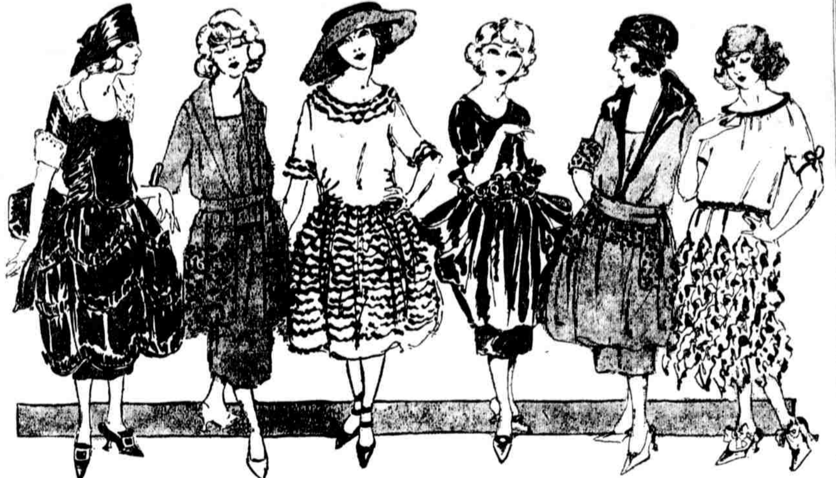
Woman's Taffeta $39.75