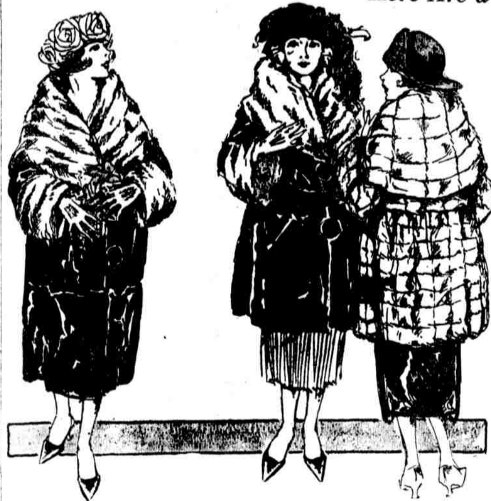
Hudson Seal with Australian Opossum, $479

Here Are a Few of the Many Interesting Coat Reductions