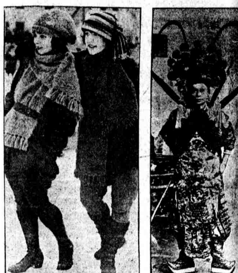
A CHINESE ACTOR. He still appears in the quaint costume used in China in the sixteenth century.