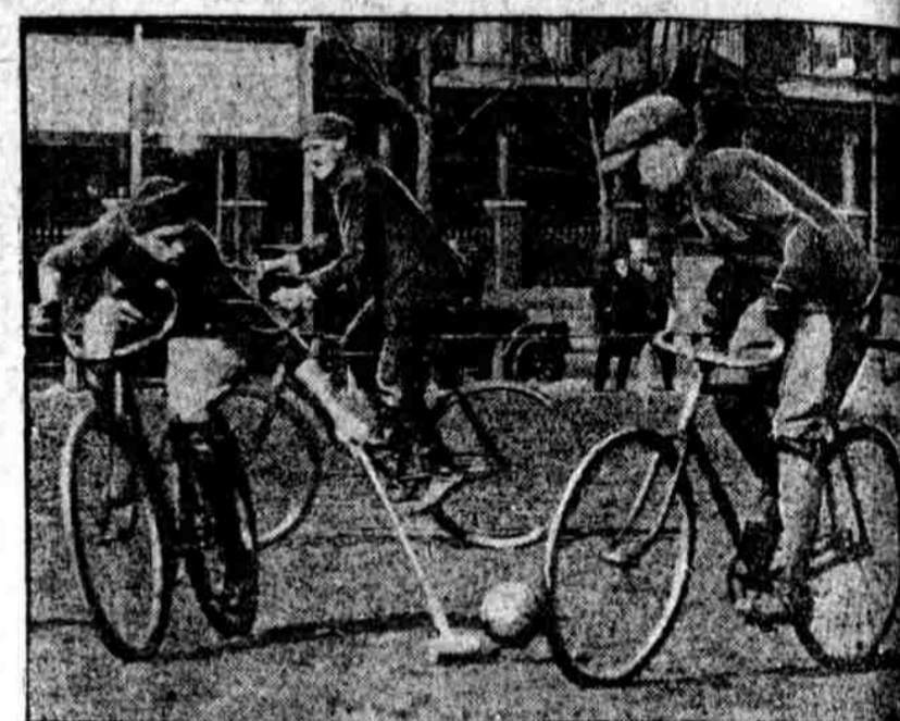
BICYCLE POLO GAME. The Quaker City team and the Olympics played yesterday morning on the vacant lot at Broad street and Allegheny avenue.