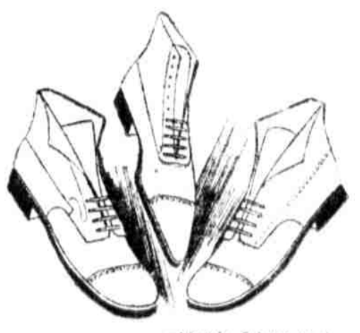
—Gimbel's, Subway Store.