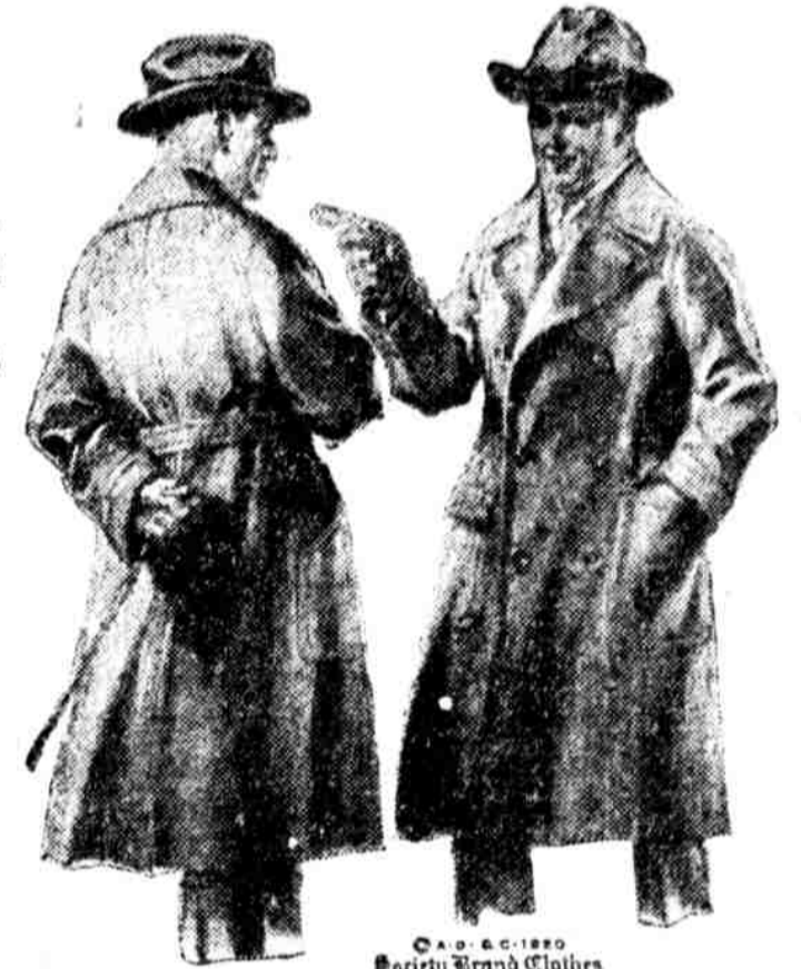
Society Brand Clothing

All sizes in every price-group, though not necessarily in all styles—but every suit or overcoat is a "whale of a bargain"!