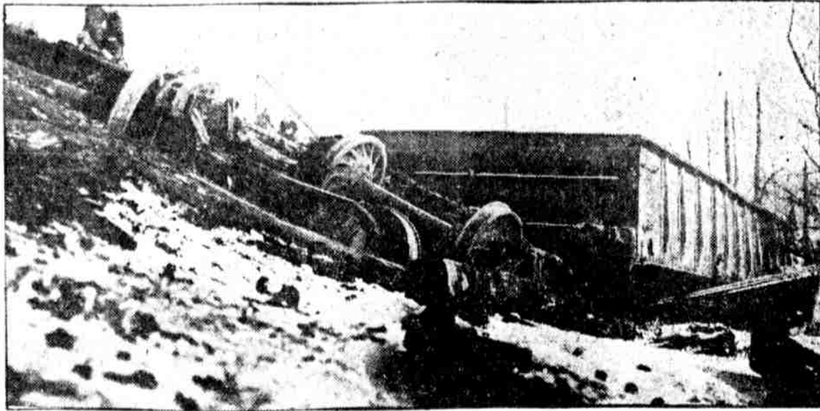
A PART OF THE PENNSYLVANIA RAILROAD SPILL. While five tracks were covered with wreckage at Plainsboro, N. J., most of yesterday, some of the wrecked cars went over the embankment. It will take several days to clear up the debris.