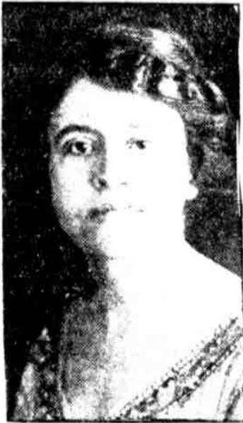
MME. OLGA SAMAROFF talks on tradition in interpretation of music in an interview on the Editorial Page.