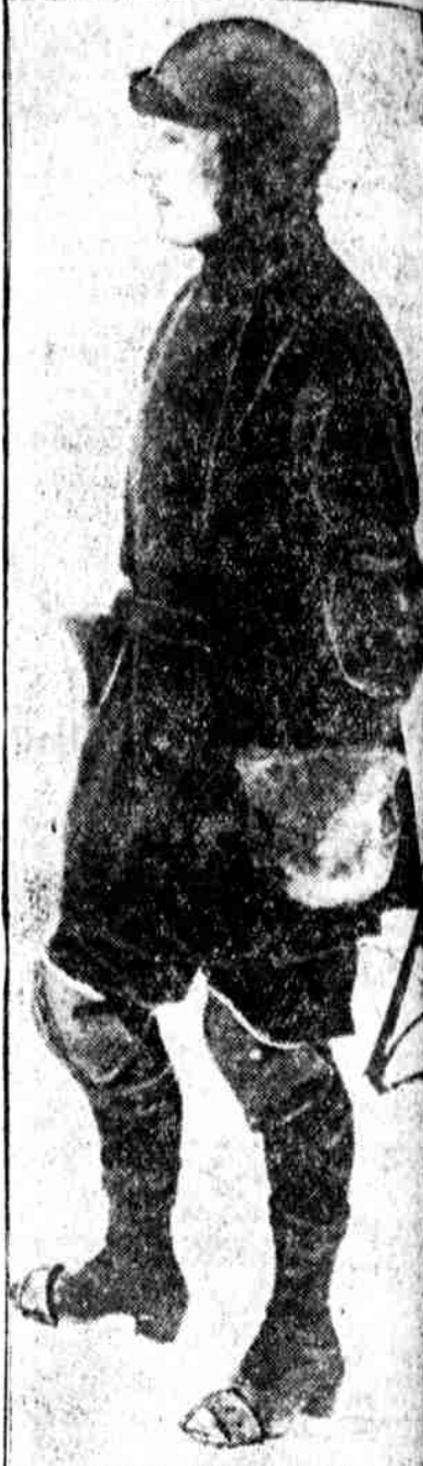
A FORMER PHILADELPHIAN. Lady Ribblesdale, formerly Mrs. John Jacob Astor, wearing unique costume, enjoying the snow sports at St. Moritz.