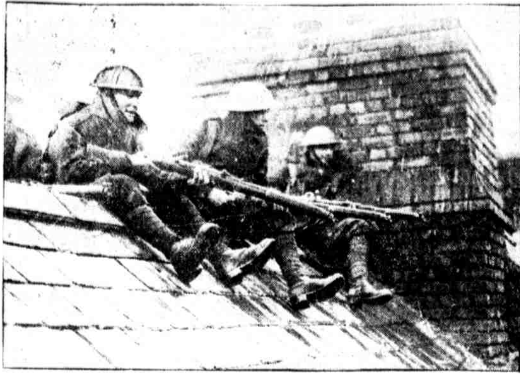
GUARDING AGAINST UPRISINGS. Soldiers on the roofs of Dublin homes are keeping watch in the besieged area, as most Dublin folks stay indoors.