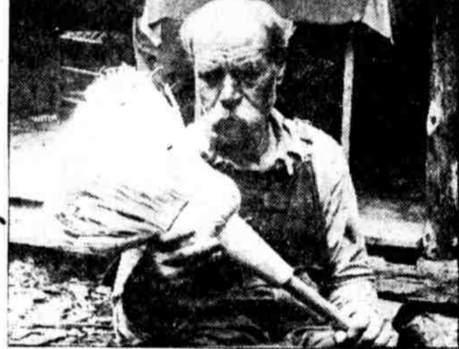
THE BROOM COMPLETED. The jack-knife man, a well-known figure of the life in the mountains of North Carolina.