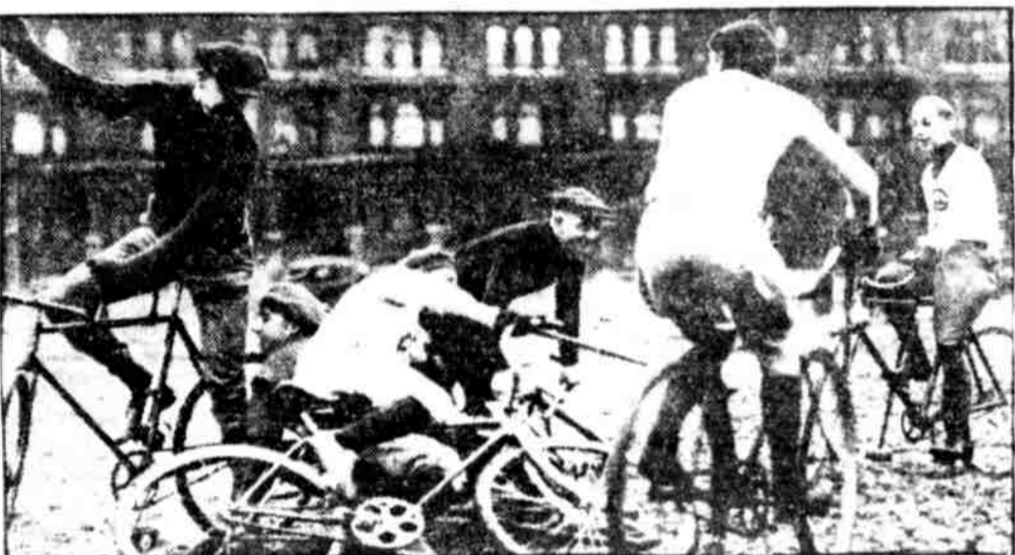
WYCKE POLO. The new game has been given a good start in the northern section of the city. An official ball is used, the mallets having a mesh rubber handle.