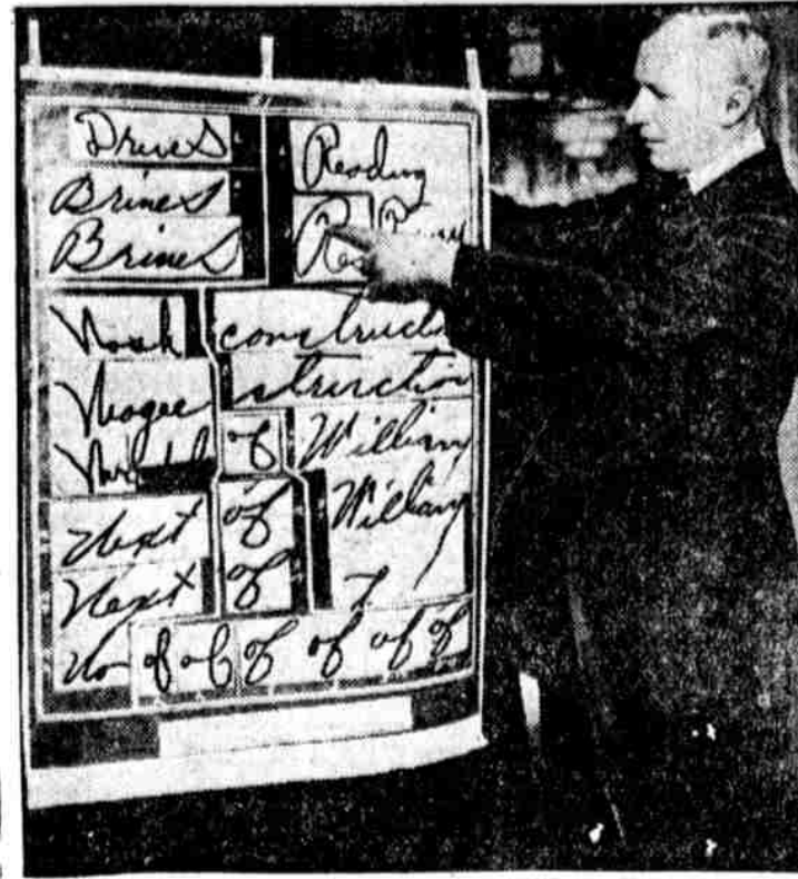
Handwritten signatures and notes on a board, including names like 'Druid', 'Reading', 'Vague', 'Wald', 'Hest', and 'No. 8-88 of of 2'.