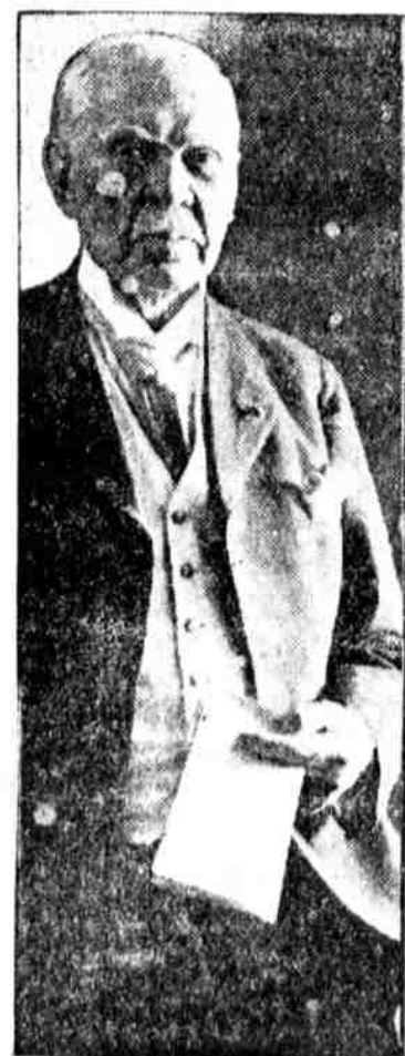
CONGRESSMAN SOON TO BE REPORTER. Representative Isaac R. Sherwood, of Ohio, will represent Ohio paper in Texas gallery.