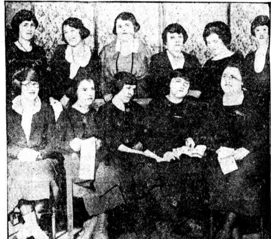
LARKIN CO. GIRLS JUDGE LIMPIN' LIMRICKS. These employees in the premium department of the Larkin & Co. building, at 1926 Arch street, picked out the winning lim'rick that is announced today.