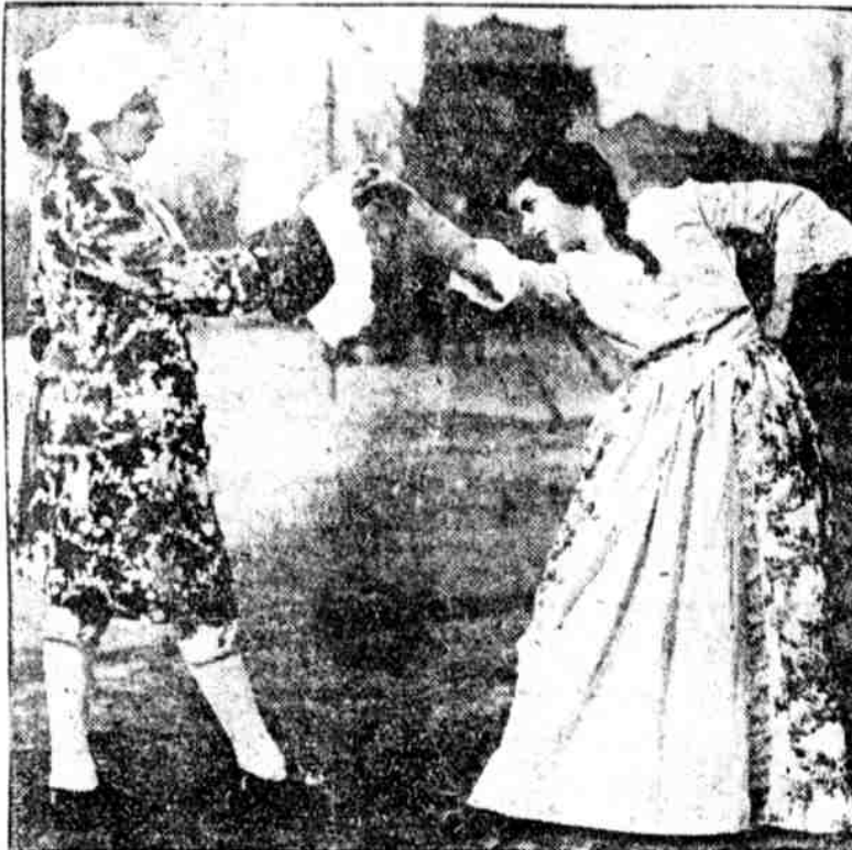
GRADUATION PROGRAM HAS HISTORIC SETTING. Pupils of the Robert Morris School, Twenty-sixth and Thompson streets, appeared in costume at the exercises, held yesterday afternoon.