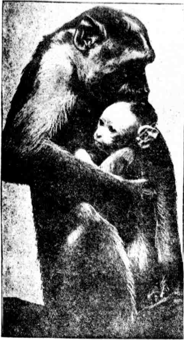
MOTHER AND CHILD. The baby macaque, less than two weeks old, with the mother monkey, at the Philadelphia Zoo.