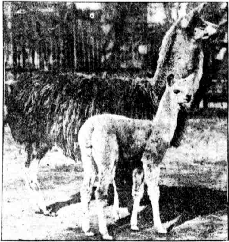
TEN DAYS OLD. Another addition to the family at the Zoo is the baby llama, shown with the mother, which stood with head erect as the photographer made an exposure.