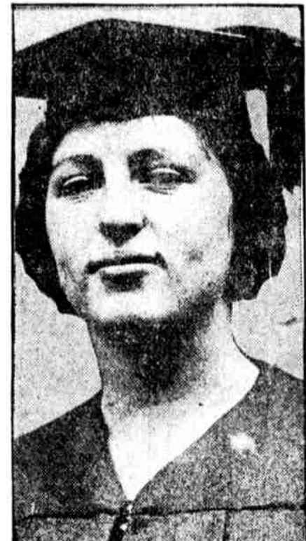
CLASS OFFICERS. Nearly two hundred girls were graduated from the William Penn High School last night.