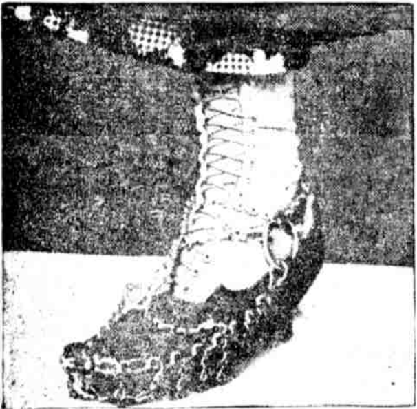
ARE YOU READY FOR SLIPPERY SIDEWALKS? The ladies wear skid-strips on their shoes in Cincinnati.