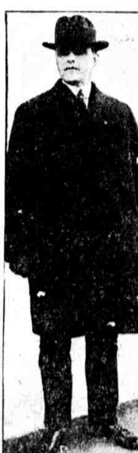
TOOK HARDING'S PLACE IN SENATE. Frank B. Willis, former governor of Ohio, occupies the place vacated by the President-elect