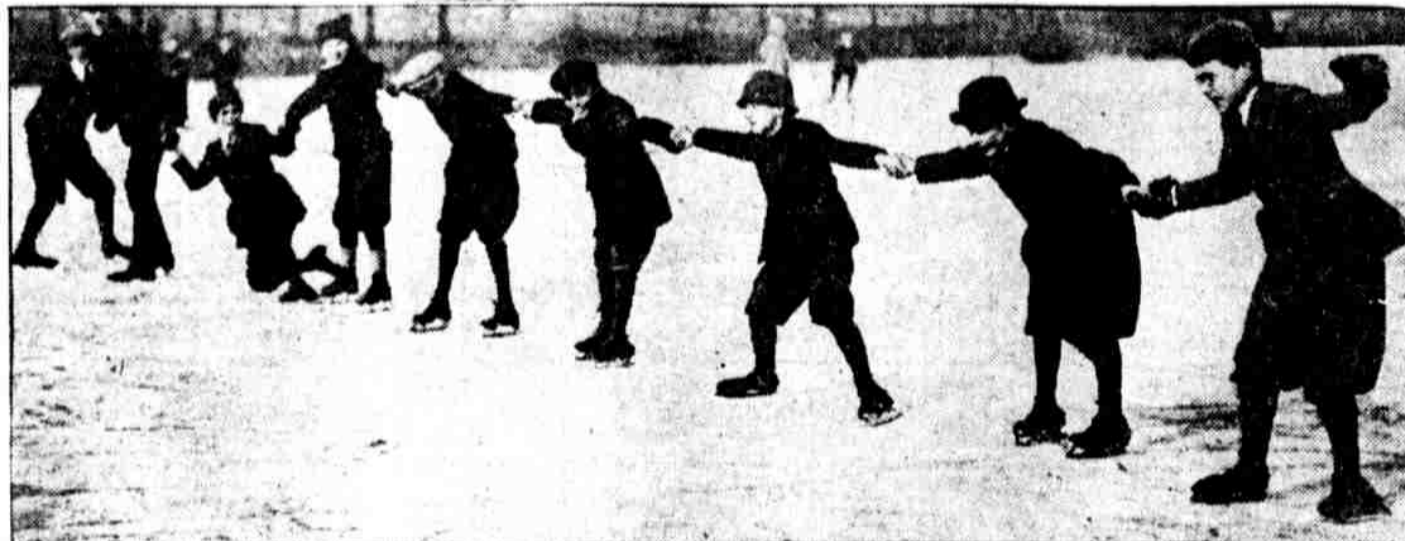
GREAT WEATHER FOR THE BOYS. The cold weather quickly made good ice along the Main Line. The photographer met this group of youngsters at Haverford. They were just making an attempt to "crack the whip"