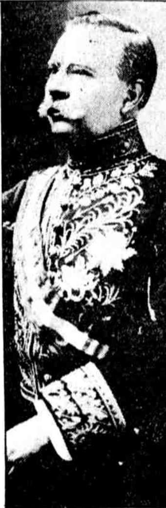
FRANCISCO DE LA BARRA, former provisional president of Mexico, will head the Greco-Bulgarian arbitration tribunal