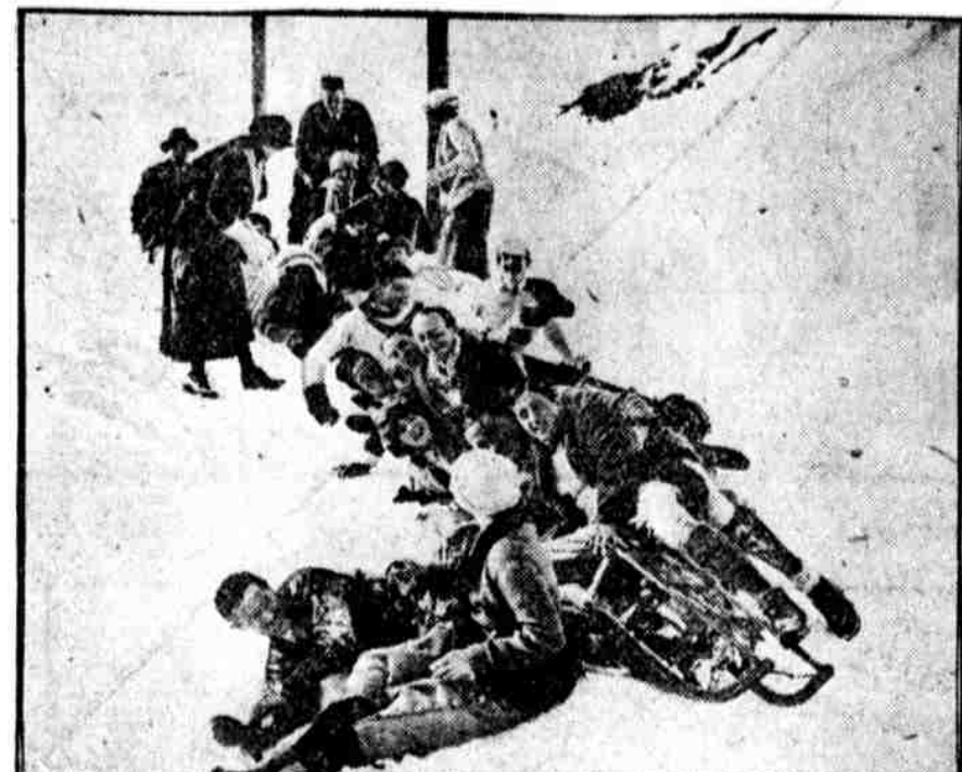
MERRY COASTERS HAVE SPILL. In Switzerland, haven for European winter sports, the photographer caught the party just as the pile-up took place.