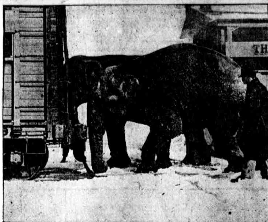
ELEPHANTS BUSY DURING CONNECTICUT FIRE. A few days ago much damage was done in a railroad yard fire, at Bridgeport, Conn. Circus elephants wintering close at hand were used to get cars from the path of the fire.