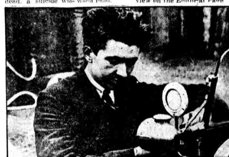
ENGLAND'S NEW PLAN FOR LICENSE TAGS. Since January 1 the official automobile license must be kept in holder. It is circular and shown near the windshield.