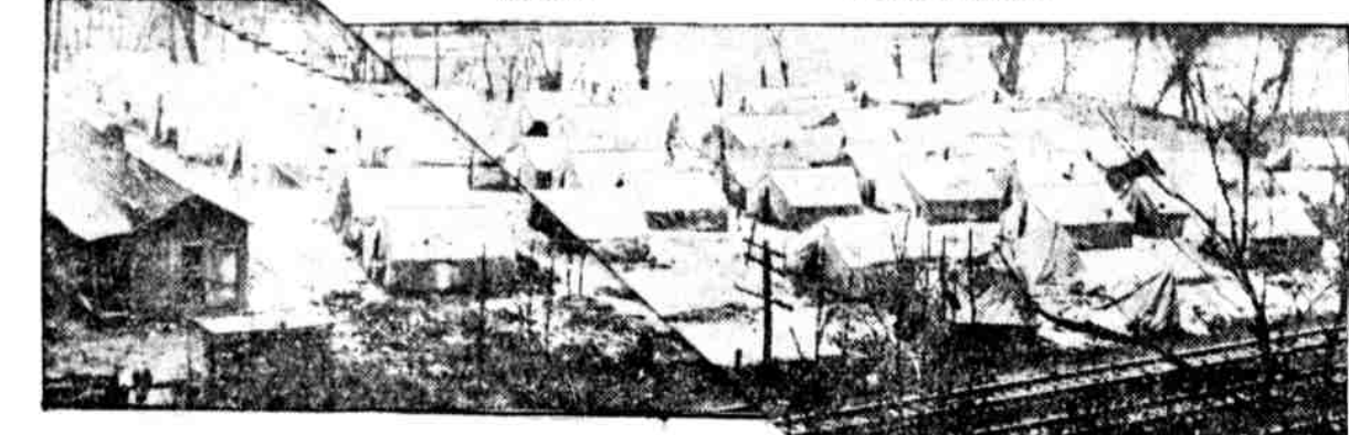
STRIKING MINERS LIVE IN TENTS. Miners in Mingo county, West Virginia, with their families have been saving rent while they fought their strike.