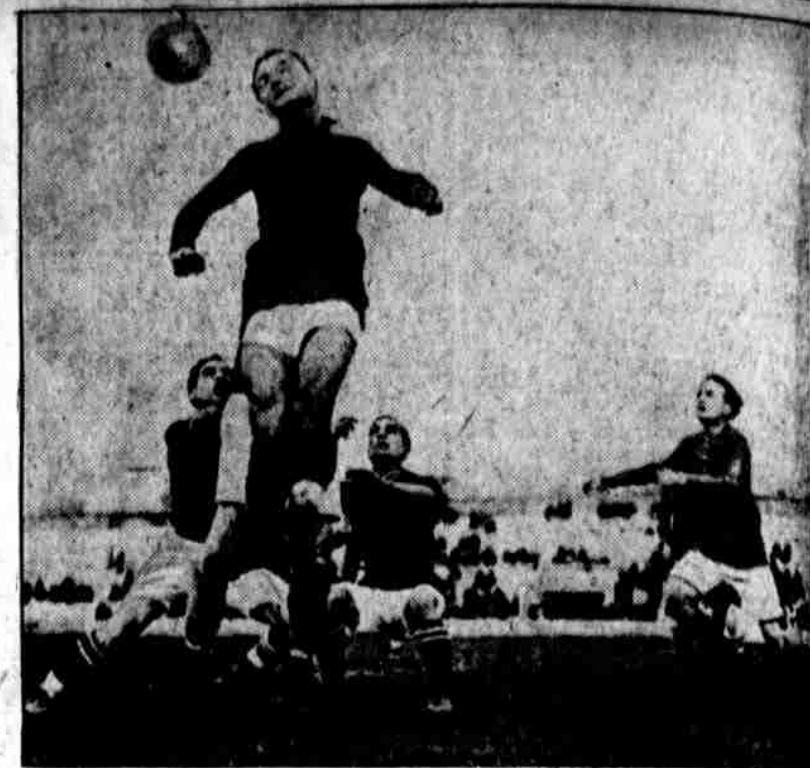
REMARKABLE FOOTBALL ACTION. A Spanish player in mid-air, where he has just struck the ball, in a contest against the Portuguese team.