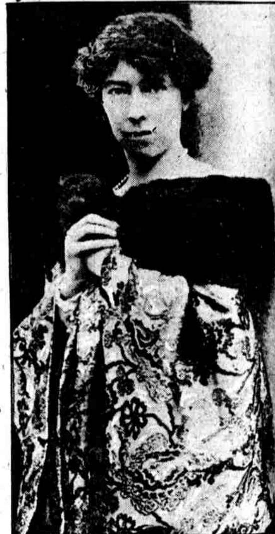
QUEEN ELIZABETH OF BELGIUM. A new and excellent portrait of the much-loved queen of the Belgians.