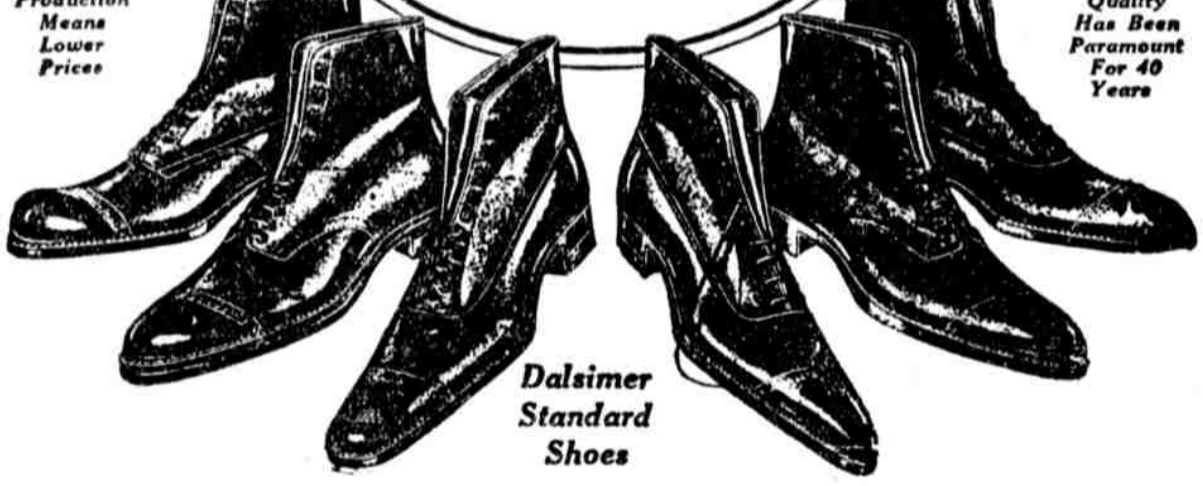
Dalsimer Standardized Production Means Lower Prices