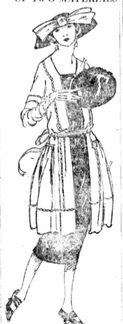
By CORINNE LOWE