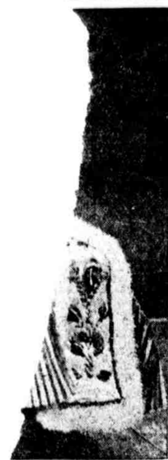
BEAR HIS ROYAL ROBES. Three-year-old princekin of the tub.