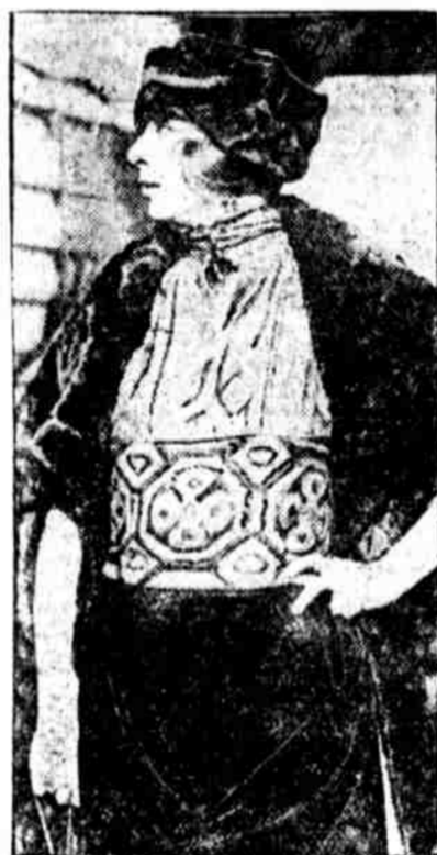
HERE FOR NEW PLAY. Blanche Yurska, arriving in New York from Europe. International.