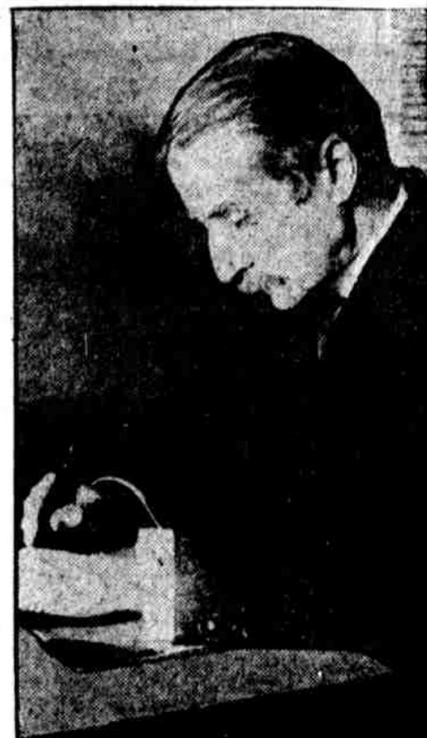
NOTED ENGLISH DRAMATIC CRITIC AND PLAYWRIGHT. William Archer, author of "The Green Goddess." He is visiting Philadelphia.