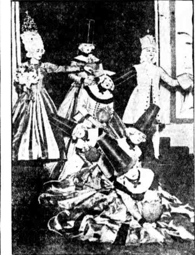
A SWEDISH WEDDING. The cone-hatted and ermine-damself are Scandinavian ballet dancers now appearing in London.