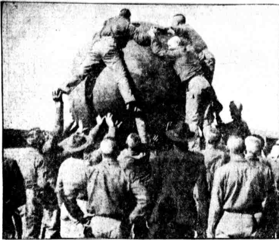
THEY'RE JUST AS PUSHING IN SPORT AS ON THE BATTLEFIELD. Uncle Sam's fighting marines, stationed at Paris Island, S. C., vigorously engaged in a strenuous game of push ball.