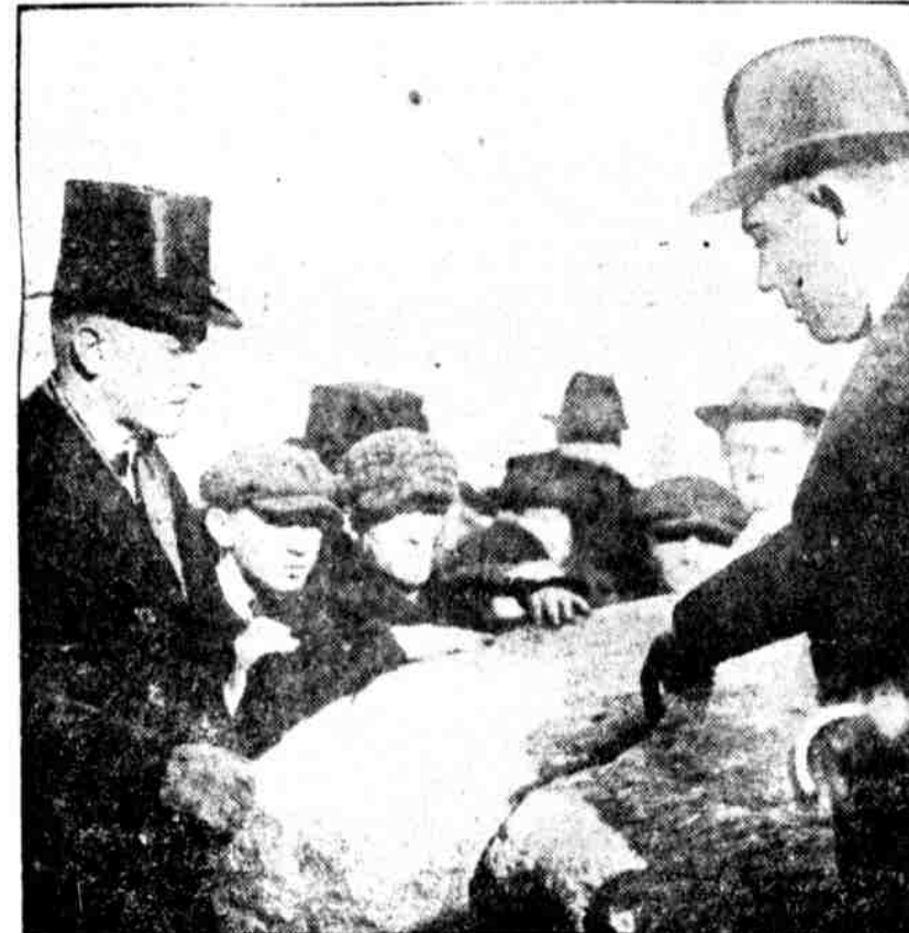
BREAK IN PLYMOUTH ROCK. Vice President-elect Coolidge inspecting the split in the Pilgrims' famous landing stone, caused, originally, when the rock was moved from its granite base, in 1775. The stone was recently restored to its shore location.