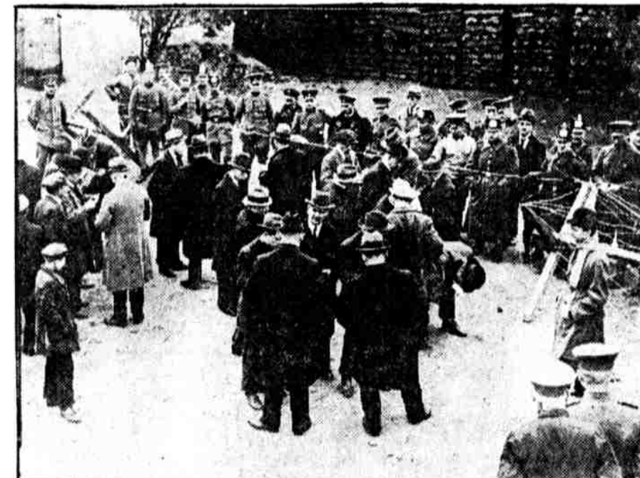
THE NEAT WAY THEY HAVE IN GERMANY FOR PROFITEERS. Trafficers arrested in Berlin instead of being confined in jails are penned up publicly under guard. It is reported this method has reduced complaints of illegal trading.