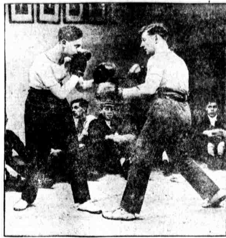
A FIGHTING PRINCE. Nicholas of Rumania, second son of the king, sparring with his instructor at Eton College, England.