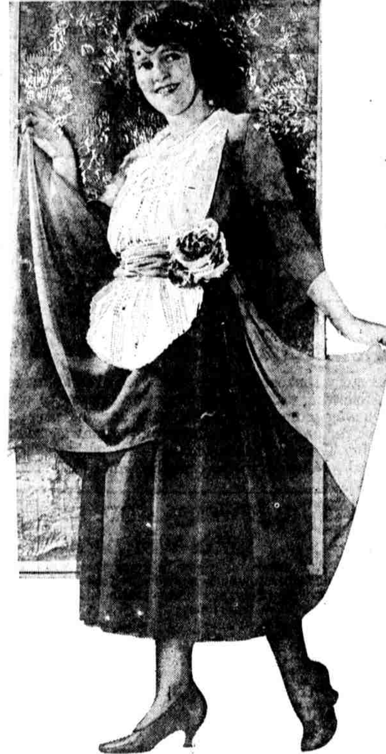
We have borrowed the apron, which used to be a strictly utilitarian feature of dress. But it has been discovered as such an attractive addition to the frock that now we have it made right on, often of the same material as the costume beneath it. The frock itself is in two tones of rose chiffon and the apron overskirt is of embroidered lingerie