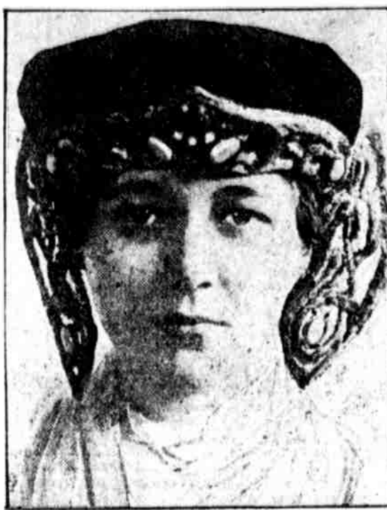
THE SPHINX HAT. A new winter toque design of black velvet, trimmed with dull gold and turquoise passementerie.