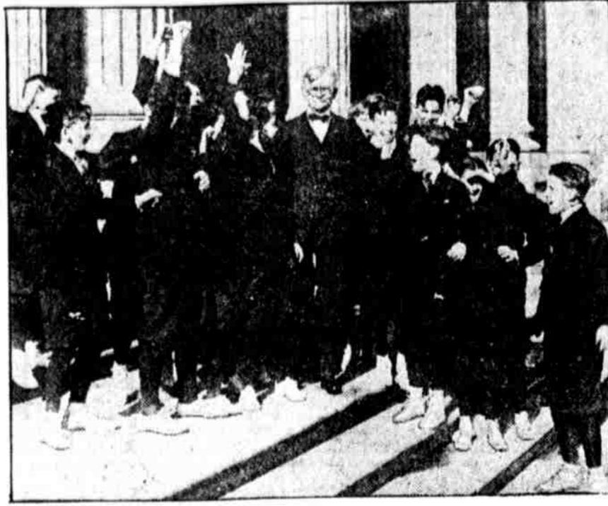
VICE PRESIDENT MARSHALL WITH THE SENATE PAGE BOYS. The boys enthusiastically accept the invitation tendered them by Mr. Marshall to the annual dinner to the boys connected with the Senate.