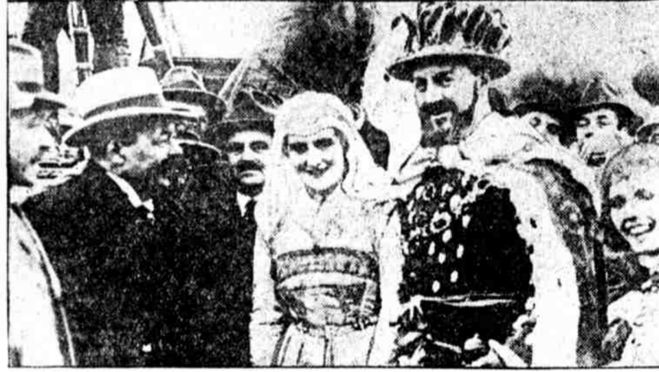
PRESIDENT EBERT VISITS "MOVIE CITY." He was photographed as he conversed with the artists who took the part of Anne Boleyn and Henry VIII in a German film entitled "Anne Boleyn." President Ebert is at the left.