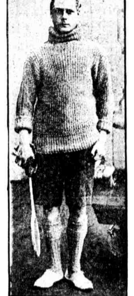
A STAR RACKET PLAYER. The Prince of Wales has been mentioned as one of the team to represent England in a contemplated international match.