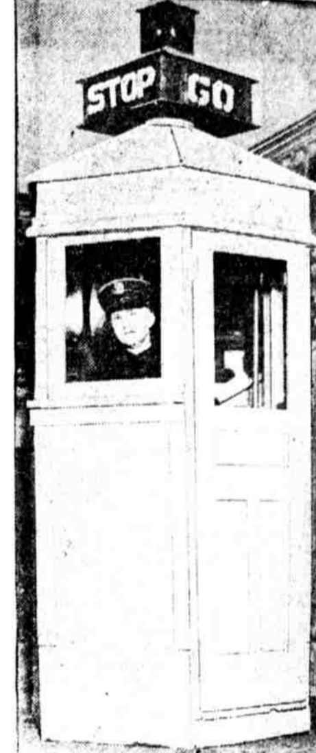
TO BE USED BY TRAFFIC PATROLMEN. This "cop's house" is a sample of the kind that will be placed on many of the city corners to shield patrolmen in storm and cold.