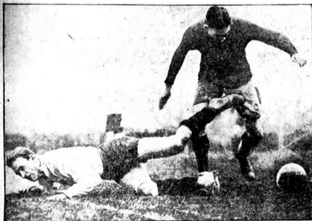
PENN WINS COLLEGE SOCCER CHAMPIONSHIP. The Red and Blue kickers scored four goals, while the Princeton team was only able to make two, in the match at the Merion Cricket Club grounds yesterday afternoon. One of the Penn players is doing a good job at protecting his face in a fall.