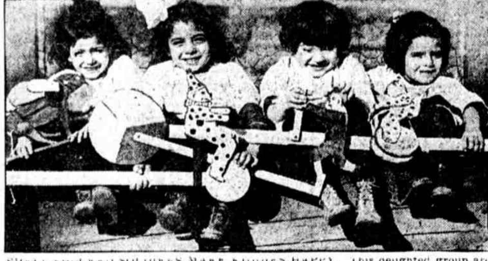
SHELL-SHOCKED SOLDIERS MAKE KIDDS HAPPY. This delighted group are playing with toys made by soldiers under treatment in United States army hospitals. The Knights of Columbus are doing the distributing.