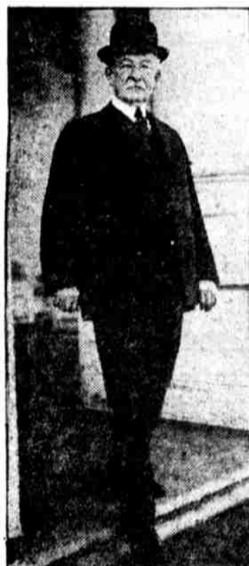
ONLY GREAT-GRAND-FATHER IN THE SENATE. Senator Carroll S. Page, of Vermont who has this distinction.