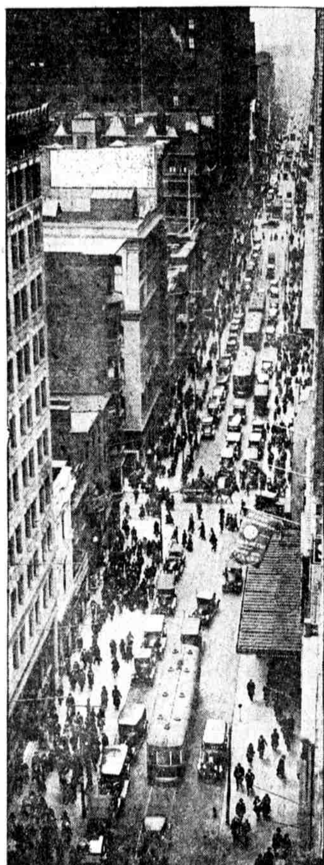
A CANYON OF HOLIDAY ACTIVITY. The camera clicked as it was pointed from the top of a building near Eleventh street, showing Chestnut street, looking west from Twelfth street. Street cars, automobiles and pedestrians fill up the far too narrow thoroughfare.