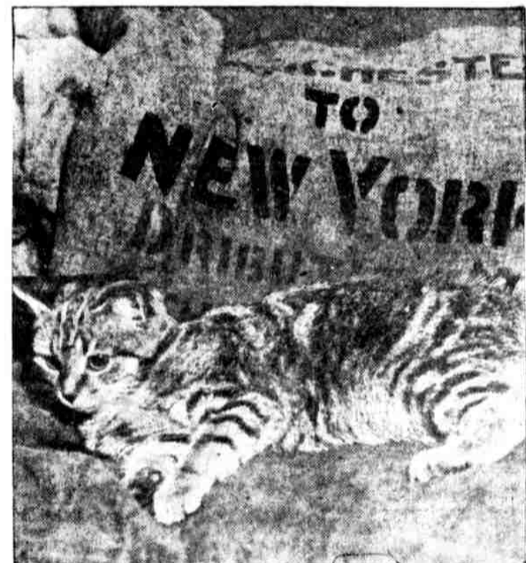
CAME FROM MANCHESTER, ENGLAND. This cat was found, in a weakened condition, in a mail bag, which came from the English city to the New York postoffice. The cat was in the bag nine days, getting just enough air to avoid suffocation.