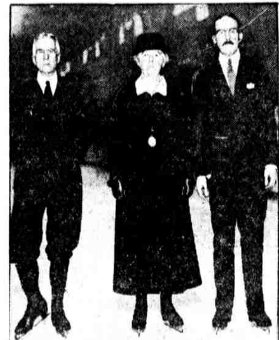
SOCIETY ON SKATES. The Philadelphia Skating Club has resumed its meetings, which are held twice a week at the Philadelphia Ice Palace. Many of the members are becoming efficient skaters.