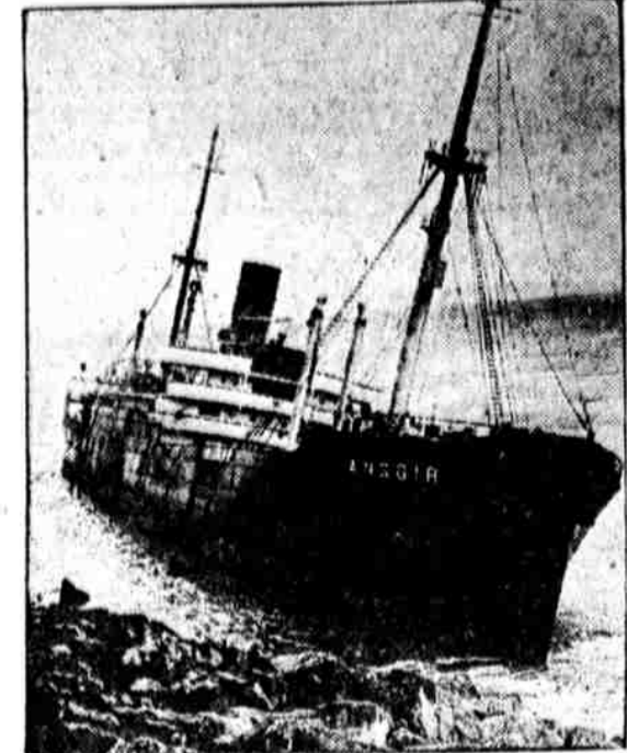
WRECKED BRITISH STEAMER ANSGIR. It is shown at Mount's Bay, near Penzance, England, where it was blown ashore during a gale. A boy did much to save the crew of forty-five men by getting the line ashore.