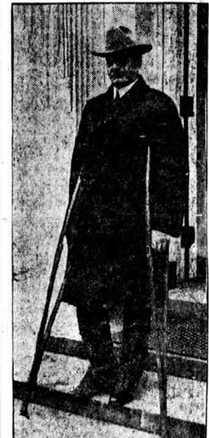
ON CRUTCHES BUT A BUSY MAN. Congressman Frank W. Mondell, the majority leader in the House.