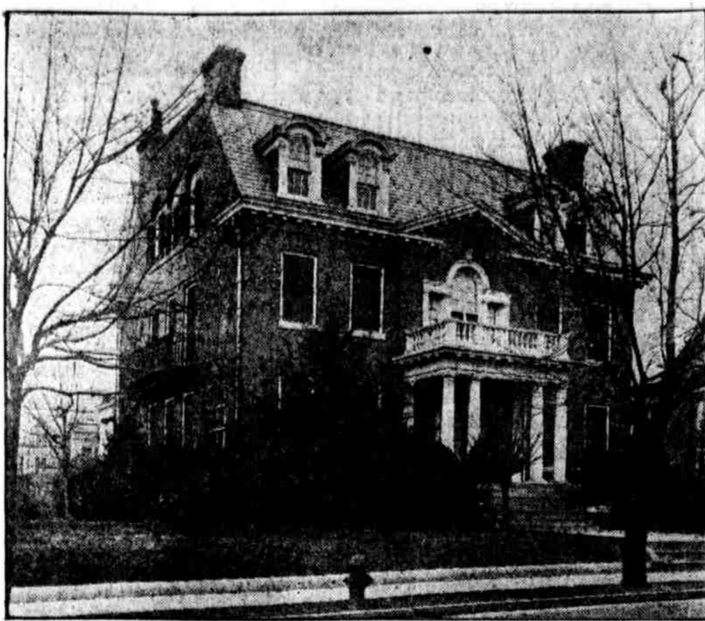
WILL LIVE IN WASHINGTON. President and Mrs. Wilson have decided to remain in the capital city after March 4. This home, owned by Congressman Alvin T. Fuller, recently elected lieutenant governor of Massachusetts, according to reports will be purchased by Mr. Wilson.