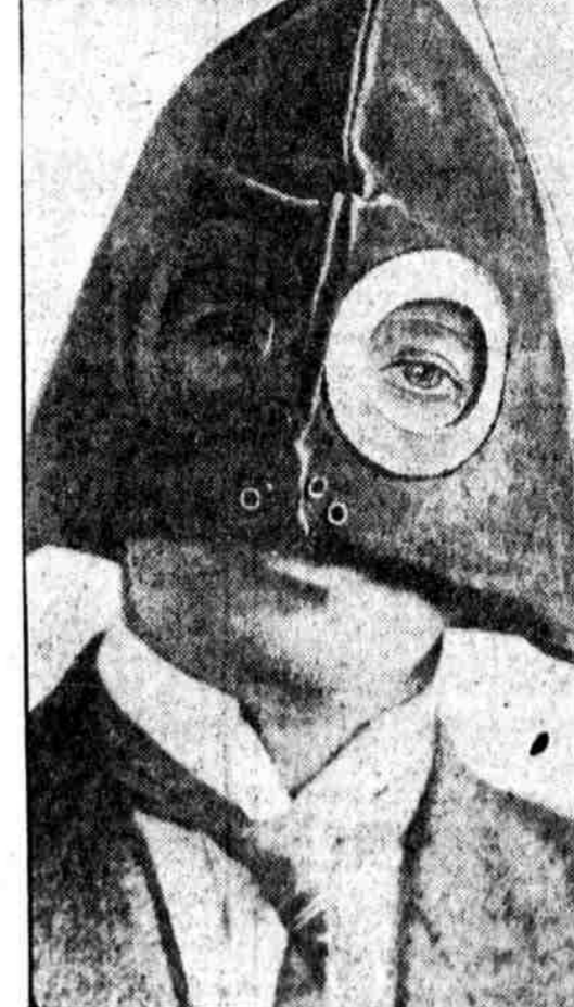
A NOVEL AUTOMOBILE HAT. This leather hat with removable eye pieces is now being used in Paris.