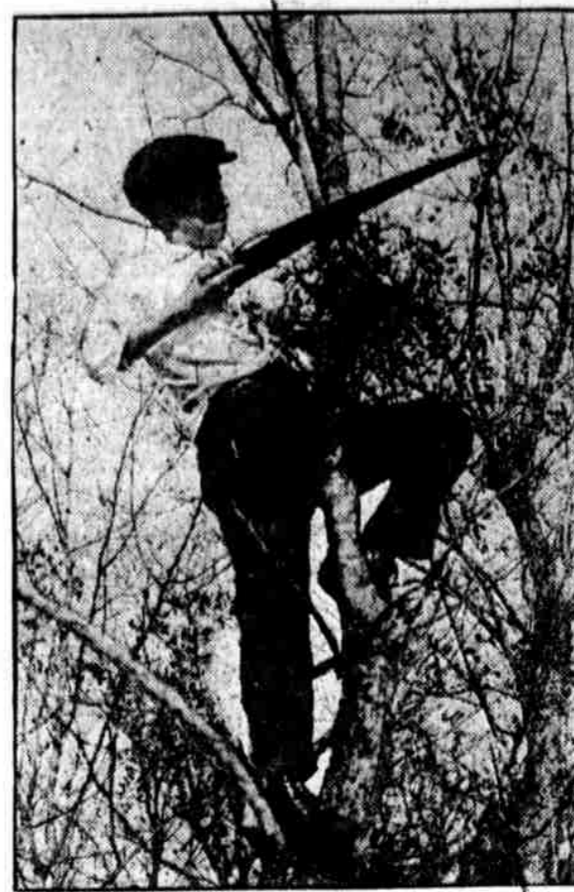
GATHERING MISTLETOE. The lad is sawing off a limb laden with choice mistletoe, for the society folk at Pinehurst, N. C.