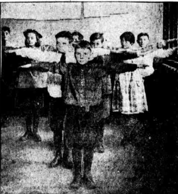
WHAT TO EAT—HOW TO EXERCISE. Some of the things that are being taught the children of Philadelphia in the children's clinic of the State Department of Health, 1724 Cherry street. After the exercises the boys and girls are weighed by Miss B. Hayes, who then decides the future procedure in the plan of building up the bodies to normal.