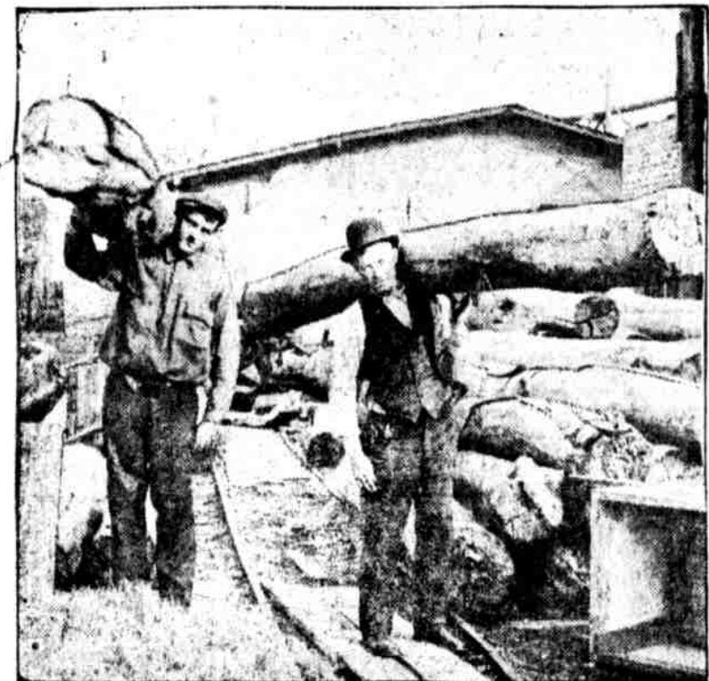
EASY TO CARRY A WHOLE TREE. These men are not performing any great physical feat. They are carrying balsa trees, which grow in Ecuador, South America, and weigh about seven pounds per cubic foot.