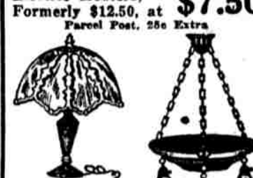
Table Lamps Gas or $9.95 Electric, 3 Light $7.25 Special

Christmas Specials Formerly $12.50, at $7.50