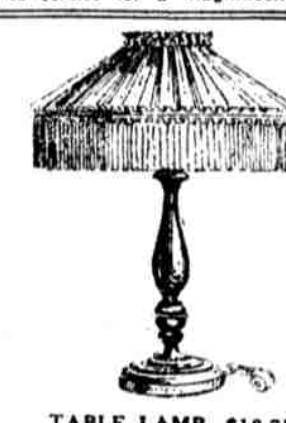
TABLE LAMP, $18.75 Mahogany finish Base with two lights. Has handsome 18-inch alla shade, in choice of Rose, Gold or Riuse lined with American Heasty, Height, 20% inches. Complete with bulb, cord and plug. $18.73 Other Table Lamps, $10.00 to $150.00.

Reed Fiber Rocker, $14.75 Well built, handsome and restful-tins siylish and hospitable Baronial Brown Rocker has spring seat, loose cushions and upholatered back. Cov-ered with fine and prettily flowered Cretonne. A useful and inexpensive Offt. Chair to match, same price. Other Reed Rockers from $5.00 up.