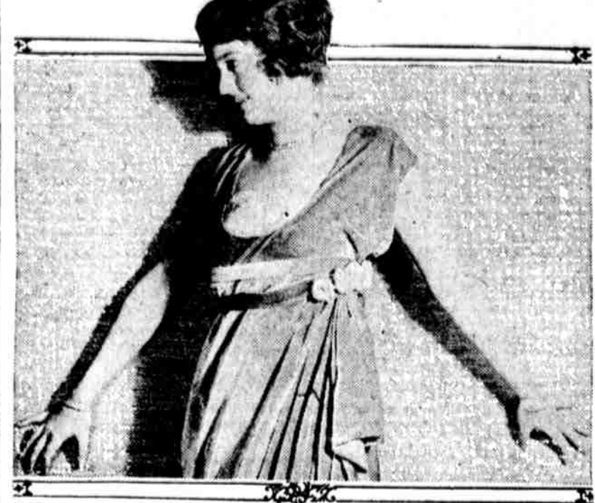
Is sometimes difficult to arrange gracefully, if you are doing the draping If you are wondering just how you can fix that beautiful velvet you want to make into an evening gown, perhaps this suggestion will help you. The gown above has the folds of velvet brought around to the side of the front, where they are held with a row of flowers and two girdles of velvet. The side, faced with chiffon, is allowed to cascade