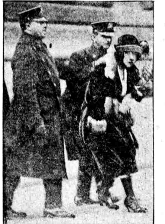
JUST GETTING HER TO MOVE ON. The New York police are forcing one of the women members of the crowd that attacked the Union Club to get out of the region of the strack the attack.