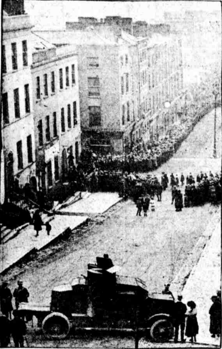
ARMORED CAR AT MACSWINEY FUNERAL. This bit of military equipment and a guard were stationed along the route of the funeral in Ireland, to be used in case of an outbreak.