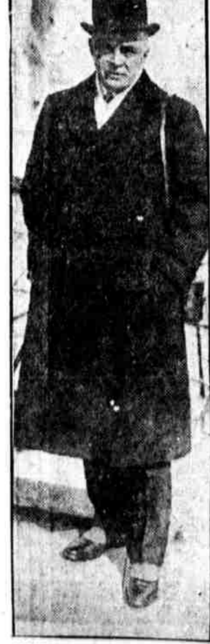
NEWCOMB CARLTON, president of the Western Union Telegraph Co., heads long dispute with State Department.