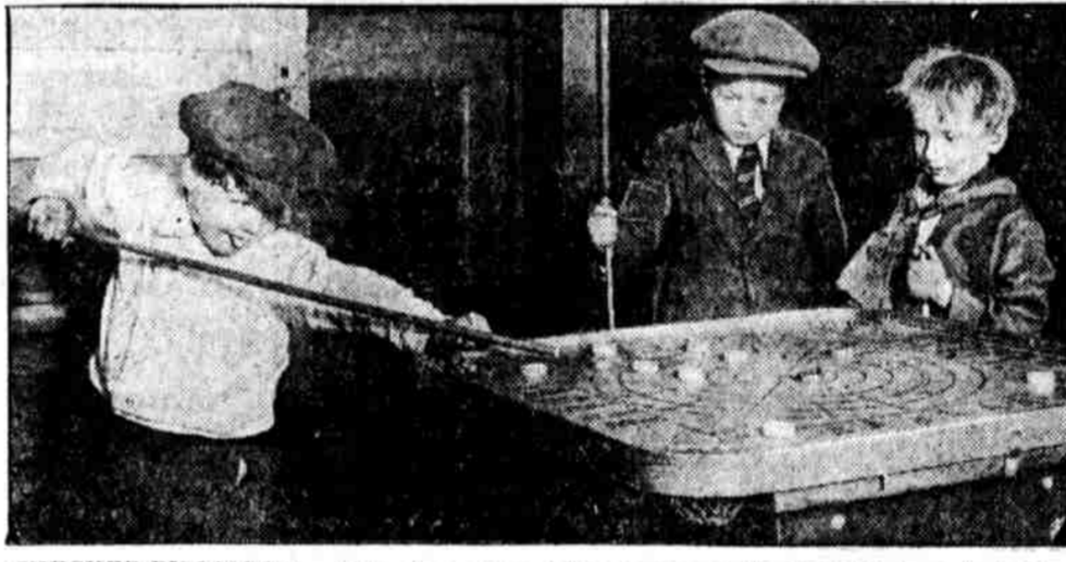
CHECKER-BILLIARDS. This close game is in progress at the Boys' Club conducted by the Volunteers of America, at 1025 Callowhill street.