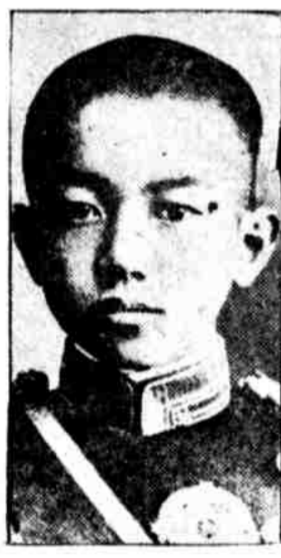
CROWN PRINCE OF JAPAN. He will soon start on a tour of the world. The heir apparent will be accompanied by a large entourage.