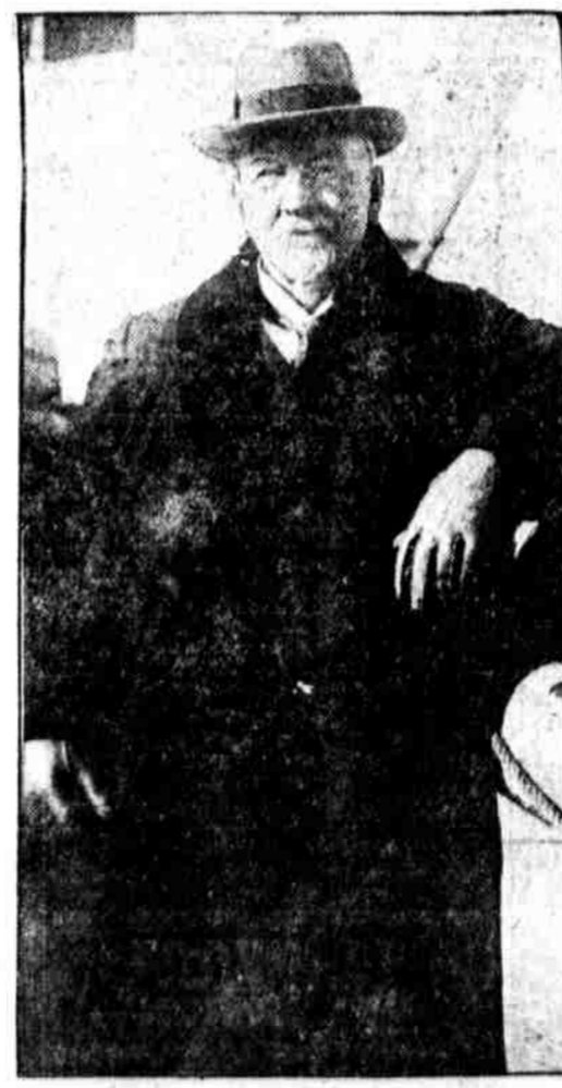
HENRY ARTHUR JONES, noted English playwright, is in this country to aid the directors in producing some of his best works.