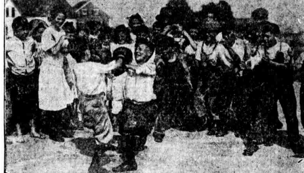
IT MUST BE A FIGHT TO A FINISH. We see no referee in this bout, staged by school boys in Boston. The ring-side folks are enjoying the tilt.