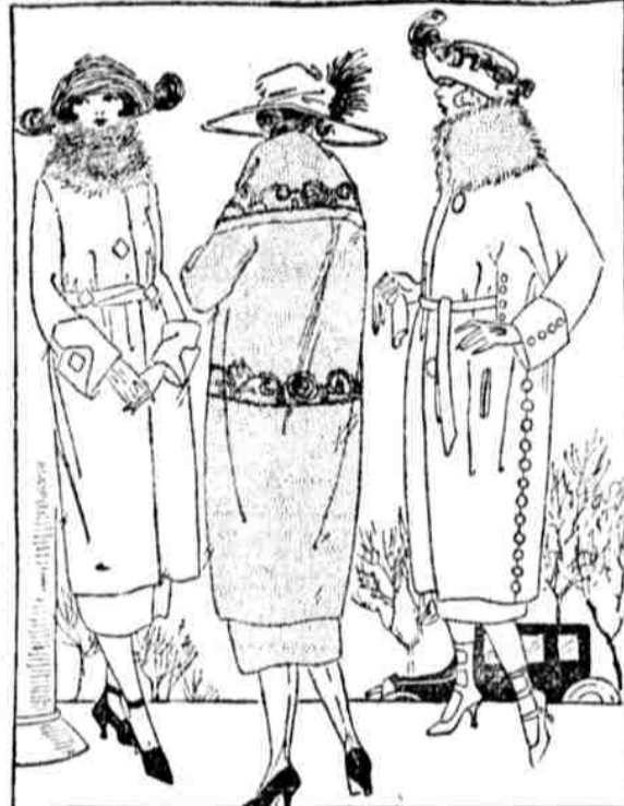
$49 $19 $49

Silk-lined velour, woollyne and silver-tone bolivia, some with cuffs as well as collars of fur. Many have hand-tailored touches such as hand-made buttonholes and hand-finished linings. Choose Australian opossum, nutria or sealene.