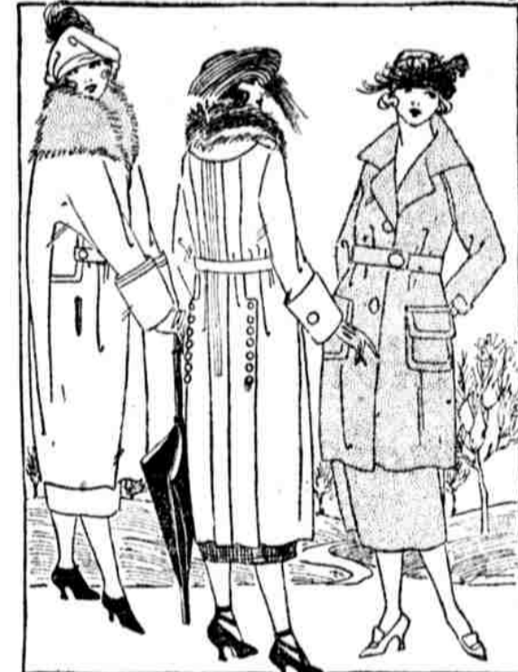
$49 $39 $49