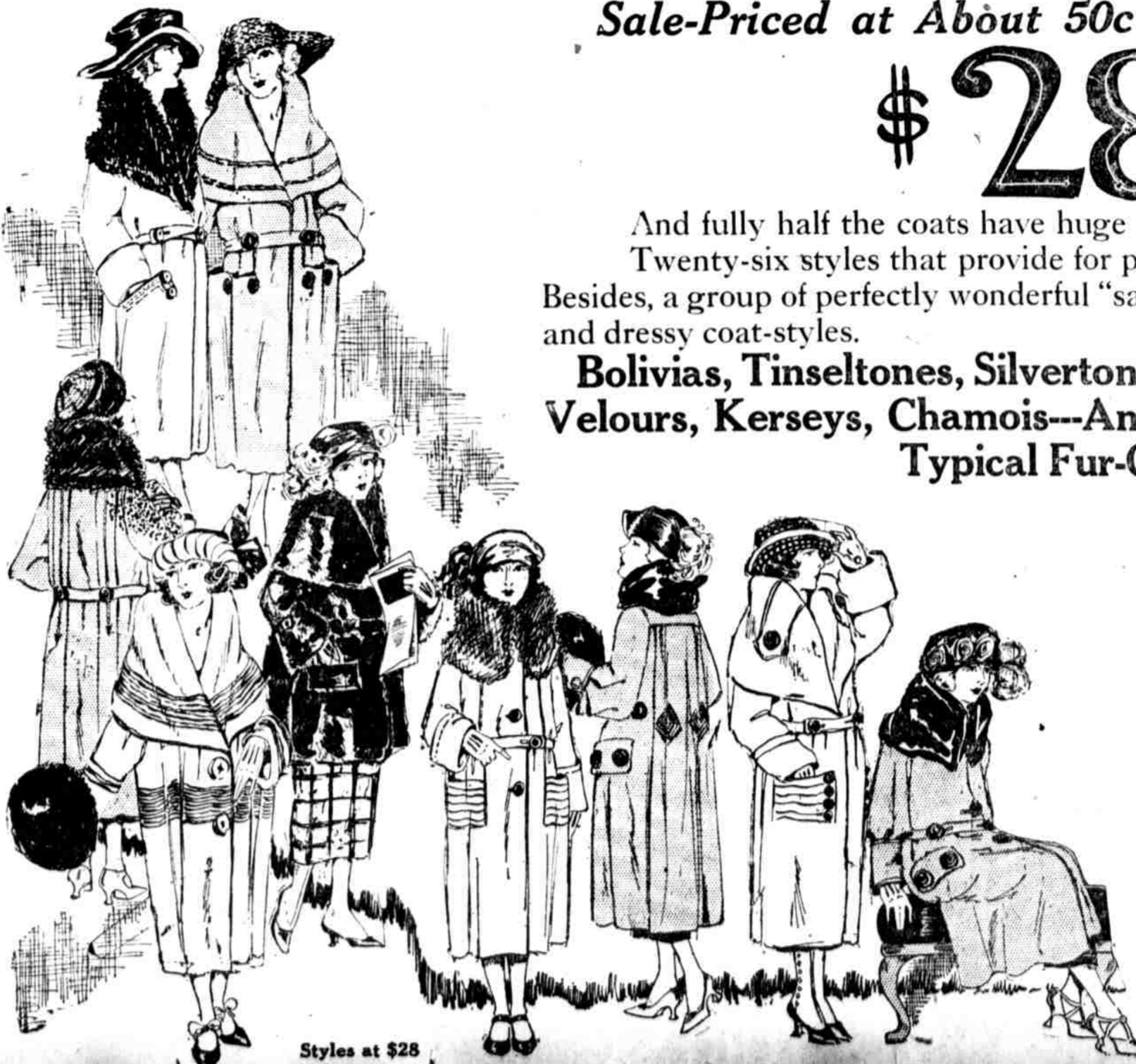
Styles at $28