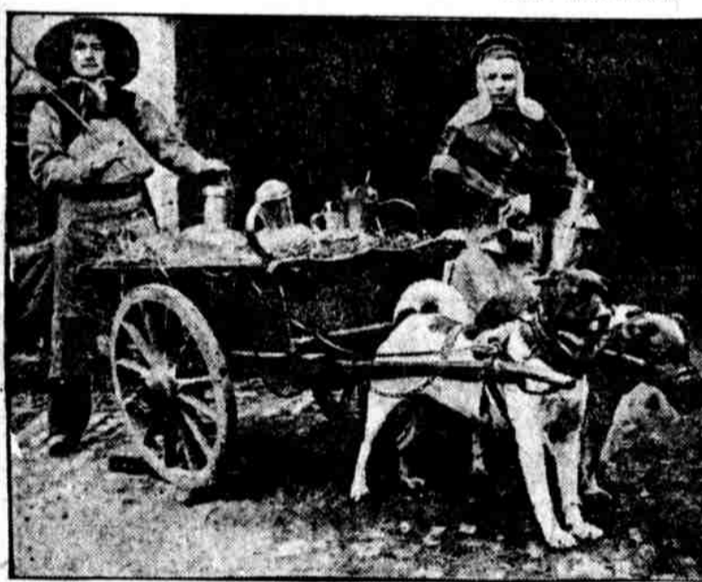
THE MORNING MILK. In Holland, dogs are used to draw milk carts for the morning delivery. The milkman and a milkmaid are willing to walk.