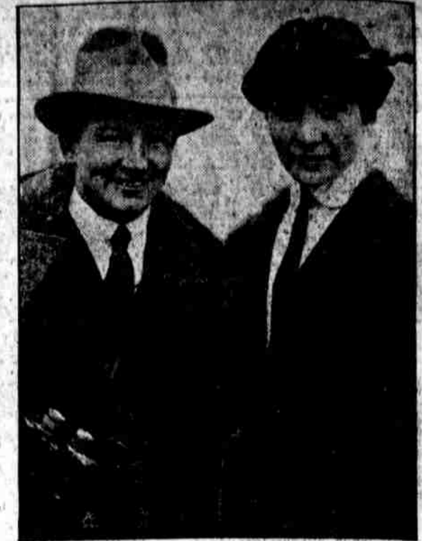
INVENTOR OF FOKKER PLANE. A. H. G. Fokker, with Mrs. Fokker, arriving in New York from Holland. His planes were used by the Germans during the war. The Fokkers are Dutch.