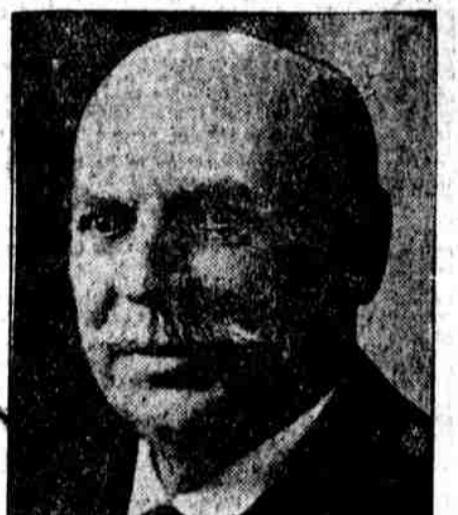
TENNESSEE'S GOVERNOR-ELECT. Colonel Alfred Taylor, the second Republican elected to that office since the Civil War. He is seventy-five years old.