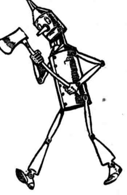
The Tin Woodman is here.

is a household of gifts for all. The magic house that makes a gift package as