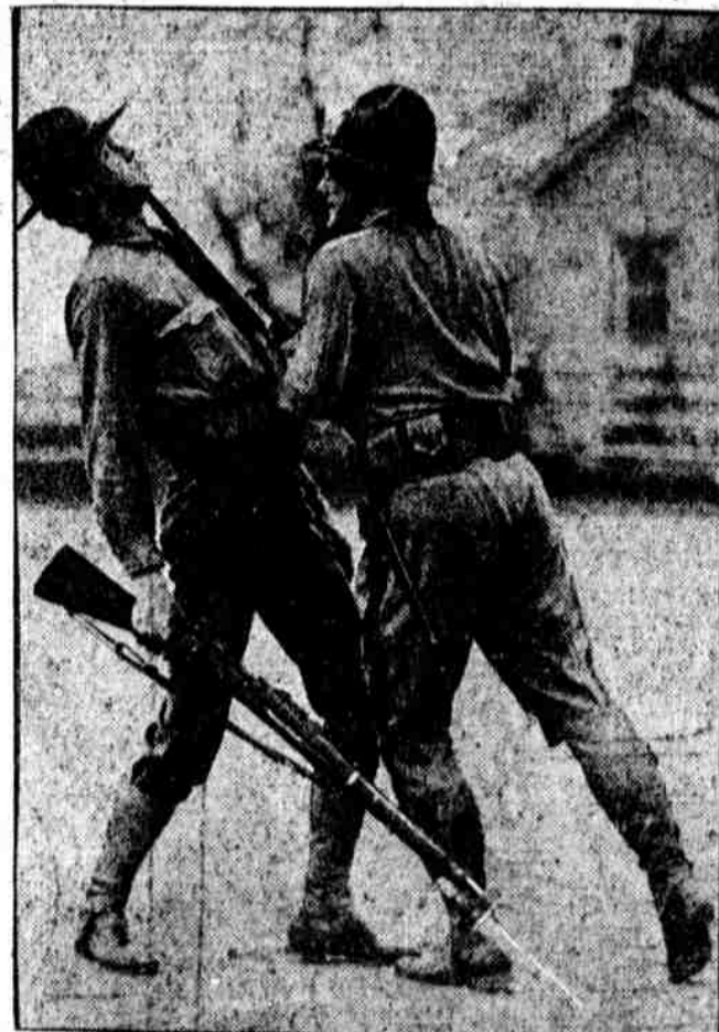
BAYONET PRACTICE. The boys down at the Pennsylvania Military College, Chester, working on close-up bayonet work. It's a reminder of the training camps.