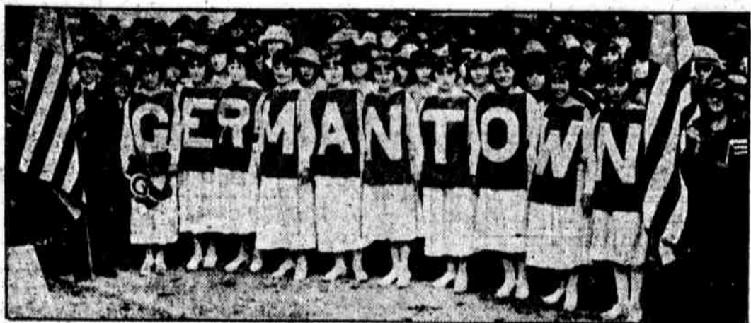
TOOK PART IN UNVEILING CEREMONIES. Ten girl students of the Germantown High School made up this group. In addition, two boy students carried the colors.