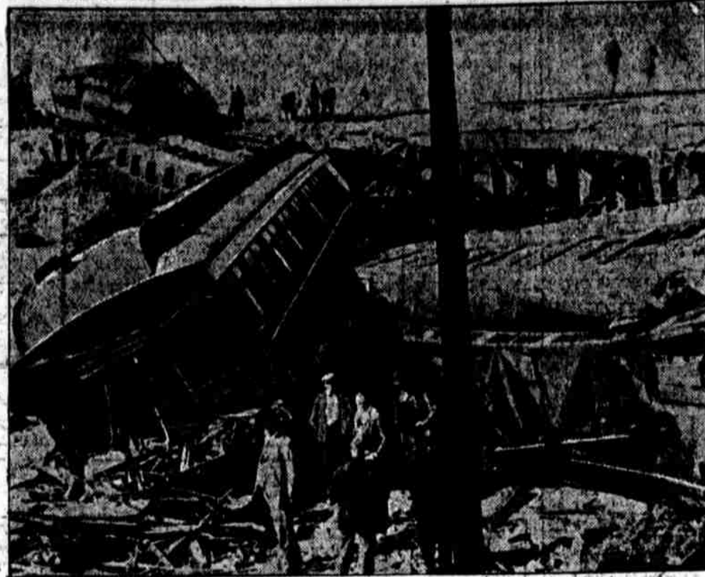
FOUR KILLED IN NEVADA WRECK. Spreading rails sent the Pacific Overland tumbling over an embankment and trestle at Manx, Nevada. Twenty-one were injured.