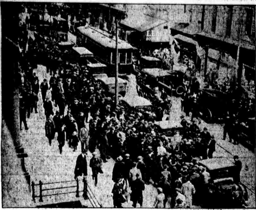
BOOZE FOR WASHINGTON LANDED IN PHILADELPHIA. This change in destination was due to interference of Chester county police. The caravan of nine touring cars was stopped at West Grove. Federal authorities brought the prisoners and whisky to the Federal Building yesterday, where hundreds watched the transfer of each bottle from the automobiles.