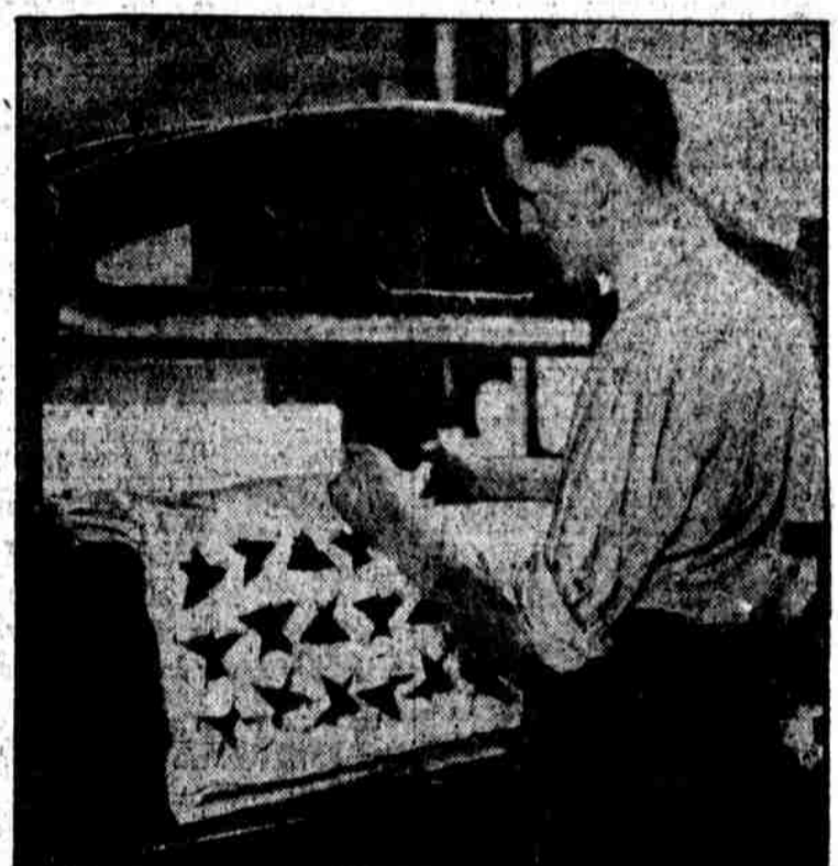
MAKING STARS. This cutting machine makes dozens of stars at a time at the Schuykill Arsenal. They are then sewed on the blue field of American flags and pennants.