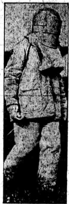
FIREPROOF. This new safety suit for airplane pilots and firemen insures the wearer against fire. An oxygen tank in the helmet prevents suffocation. Paul Thompson.